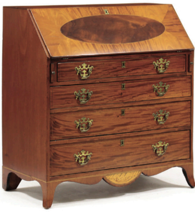
Mid-Atlantic Federal Inlaid Desk, att. Maryland, early 19th c.