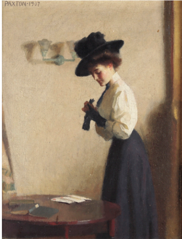
William McGregor Paxton (American, 1869-1941), Woman with Gloves