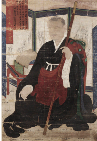
Large Korean Painting of a Monk, Joseon dynasty, 63 inches