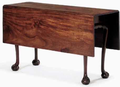
American Chippendale Dining Table, att. Massachusetts, circa 1770