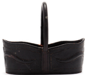
Virginia Tooled Leather Key Basket, mid 19th century