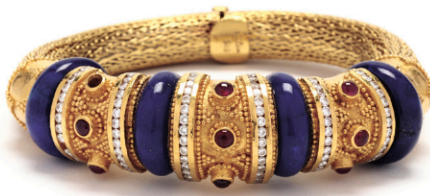
High Karat Gold and Gem-Set Bracelet, Gilan