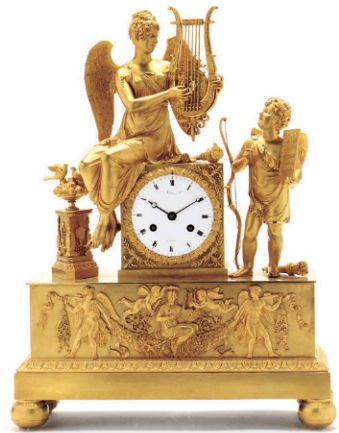
French Empire Doré Bronze Mantel Clock, Signed S. Malsan & Cie