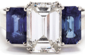
Platinum, Diamond, and Sapphire Ring