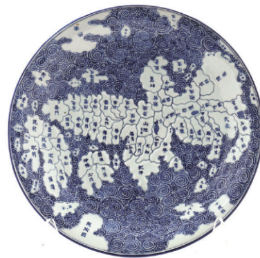
Japanese Porcelain Arita Blue and White Map Dish