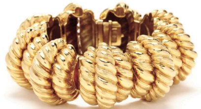
Heavy Gold Bracelet, Hammerman Brothers