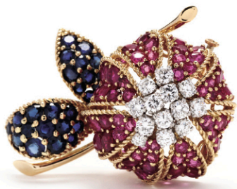
Gold and Gem-Set Flower Brooch, France