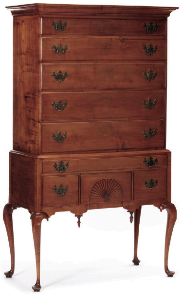
Queen Anne High Boy, mid 18th c., direct descent from the Cudworth family, Scituate/Norwell, MA