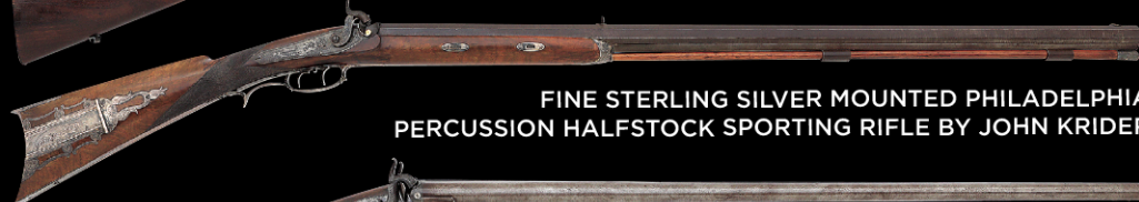
FINE STERLING SILVER MOUNTED PHILADELPHIA PERCUSSION HALFSTOCK SPORTING RIFLE BY JOHN KRIDER