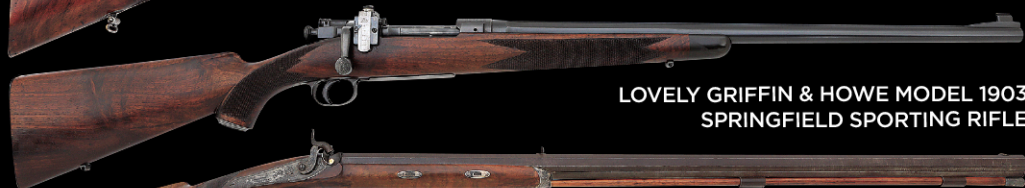
LOVELY GRIFFIN & HOWE MODEL 1903 SPRINGFIELD SPORTING RIFLE