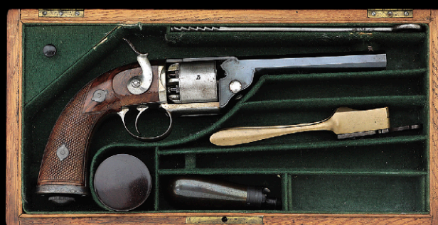
CASED FRENCH DEVISME SINGLE ACTION PERCUSSION BELT REVOLVER BY FRANCOTTE