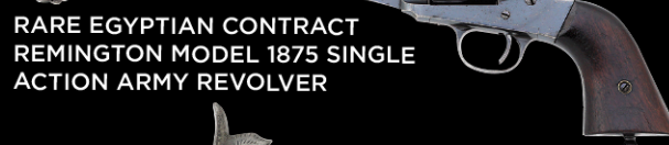
RARE EGYPTIAN CONTRACT REMINGTON MODEL 1875 SINGLE ACTION ARMY REVOLVER