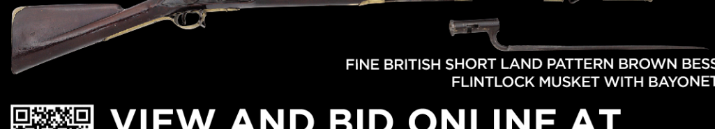
FINE BRITISH SHORT LAND PATTERN BROWN BESS FLINTLOCK MUSKET WITH BAYONET