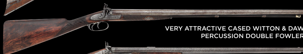
VERY ATTRACTIVE CASED WITTON & DAW PERCUSSION DOUBLE FOWLER