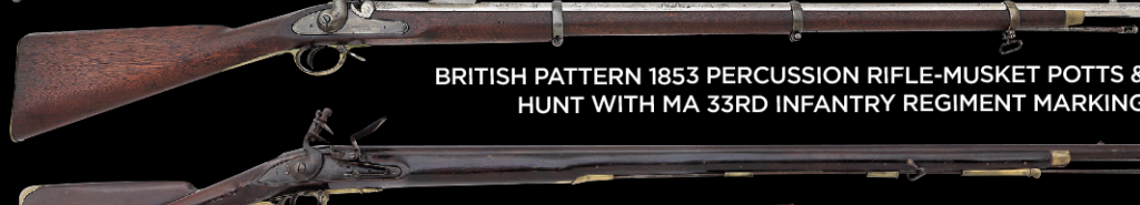
BRITISH PATTERN 1853 PERCUSSION RIFLE-MUSKET POTTS & HUNT WITH MA 33RD INFANTRY REGIMENT MARKING