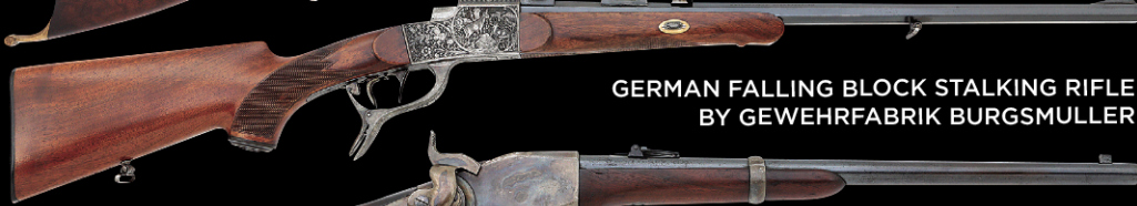
GERMAN FALLING BLOCK STALKING RIFLE BY GEWEHRFABRIK BURGSMULLER