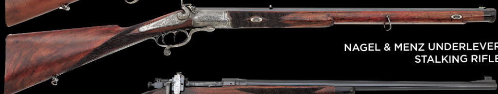
NAGEL & MENZ UNDERLEVER STALKING RIFLE