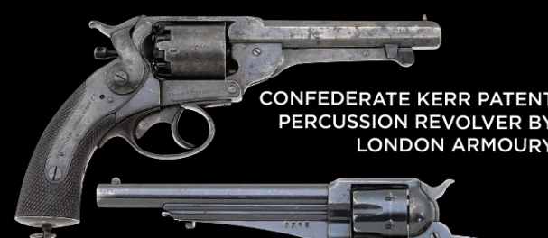
CONFEDERATE KERR PATENT PERCUSSION REVOLVER BY LONDON ARMOURY