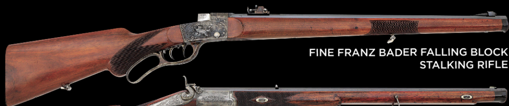
FINE FRANZ BADER FALLING BLOCK STALKING RIFLE