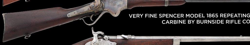
VERY FINE SPENCER MODEL 1865 REPEATING CARBINE BY BURNSIDE RIFLE CO