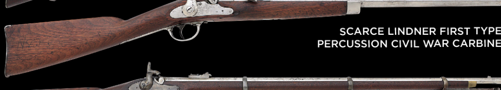
SCARCE LINDNER FIRST TYPE PERCUSSION CIVIL WAR CARBINE