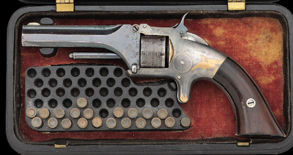
ATTRACTIVE SMITH & WESSON NO.1 FIRST ISSUE REVOLVER WITH FINE GUTTA PERCHA CASE

Just a sample of the fine arms in this auction