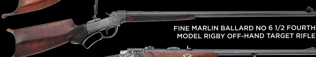
FINE MARLIN BALLARD NO 6 1/2 FOURTH MODEL RIGBY OFF-HAND TARGET RIFLE