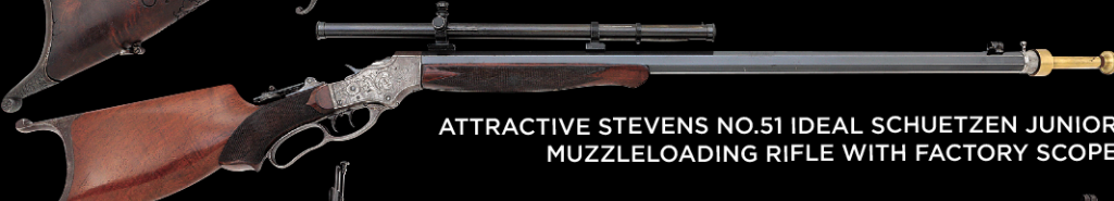
ATTRACTIVE STEVENS NO.51 IDEAL SCHUETZEN JUNIOR MUZZLELOADING RIFLE WITH FACTORY SCOPE