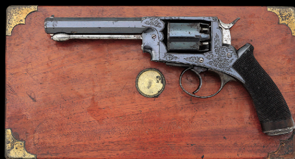
RARE CASED AND ENGRAVED DEANE-HARDING PATENT DOUBLE ACTION PERCUSSION REVOLVER