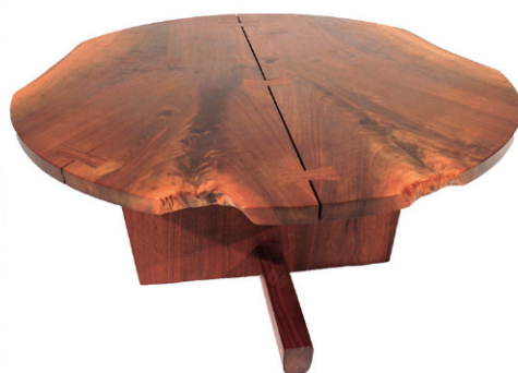
Mira Nakashima (American, b. 1942), Bookmatched Walnut 'Minguren' Coffee Table, March 12, 1997, $10,000-$15,000