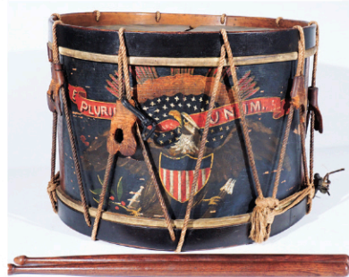
American Painted Eagle Marine Infantry Snare Drum, Bent & Bush, Boston, Circa 1860, $2,000-$3,000

♦In-Person Exhibition: Saturday, September 16, 11am to 1pm**new time**;