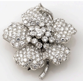
Platinum and Diamond 'Flower' Brooch, $15,000-$20,000