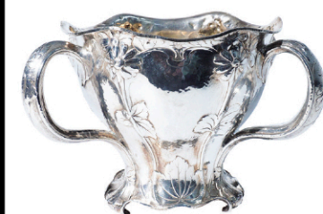
Gorham Martelé Britannia Silver Three-Handle Trophy Loving Cup, Providence, 1905, $4,000-$5,000