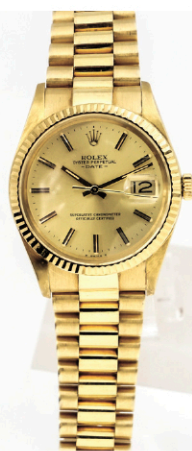
Rolex 18-Karat Yellow-Gold Automatic Oyster Perpetual Date Wristwatch, Circa 1982, $7,000-9,000