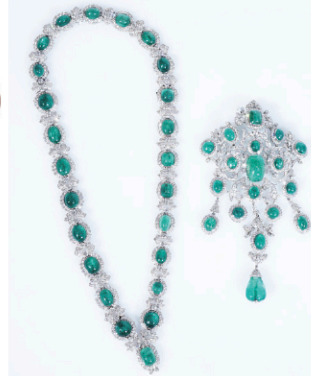
Platinum, Emerald and Diamond Necklace, $15,000-$20,000; and a Platinum, Emerald and Diamond Pendant, $10,000-$15,000