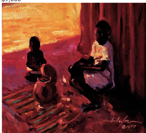
Joseph Deweese Holston (American b. 1944), Children in a Doorway , oil on canvas, $2,000-$3,000