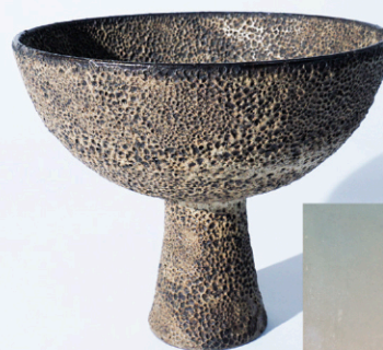
Gertrud (Austrian, 1908-1971) & Otto Natzler (Austrian, 1908-2007), Brown Crater Glaze Pedestal Bowl or Chalice, Circa 1957, $4,000-$6,000