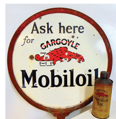
Vintage Gargoyle Oil sign, oil can