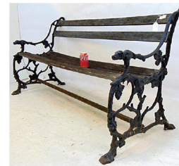
Cast iron park bench with dog heads