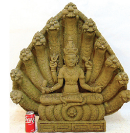
Stone temple carving