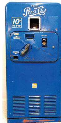
Vintage Pepsi Cola Model 33 vending machine