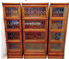
Exceptional stack of bookcase assembly with leaded doors