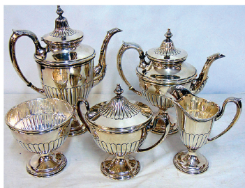
Sample sterling silver