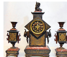
French slate & marble clock set in Japanese style