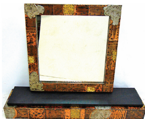
Paul Evans Patchwork Console with mirror