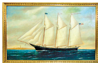
Oil, W.P. Stubbs