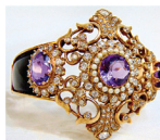
19th century 18kt gold diamond amethyst