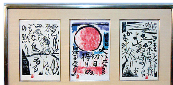
One of 4 triptychs by Shiko Munakata