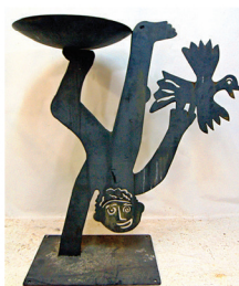
Ernest Shaw sculptures