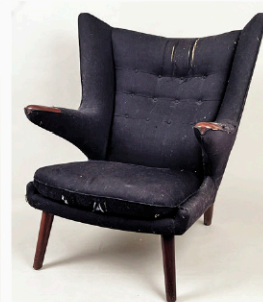
Hans Wegner MCM Papa Bear Chair