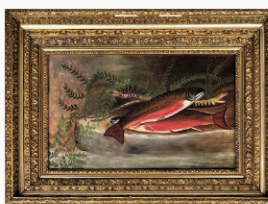
A. F. Tait, O-C Salmon On Riverbank