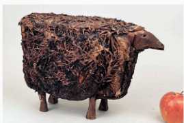
B. Langlais, Wooden Folk Sculpture Sheep