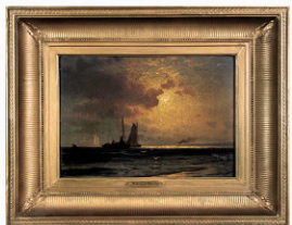
Edward Moran, Bay Of New York At Sunset