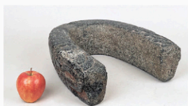
Meso Veracruz Style Ceremonial Stone Ballgame