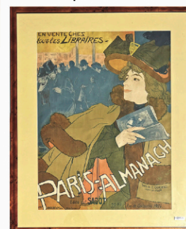
de Feure, Paris Almanach Poster