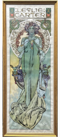
Alphonse Mucha Art Nouveau Poster