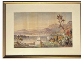
J.F. Cropsey, W-C Hudson River In The Fall