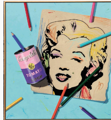
Ben Steel O-C Double Your Pleasure 2006