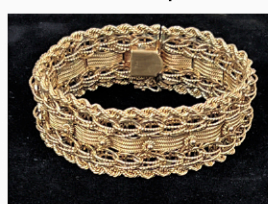
14K Gold Mesh Braided Bracelet