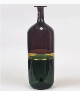
Venini Bolle Art Glass Tricolor Vase