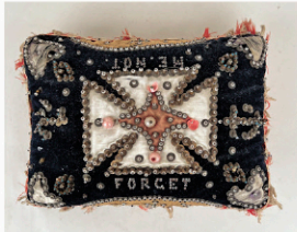
Sailor Shell Art Cushion - Forget Me Not