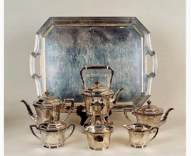
Tiffany & Co. Sterling Tea & Coffee Service & Tray