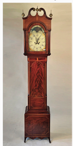
NY Hepplewhite Inlaid Mahogany Tall Clock