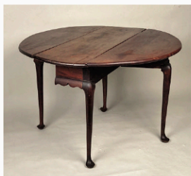
NE Queen Anne Maple Drop Leaf Dining Table