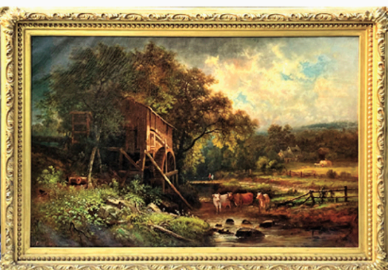
G.W. King O-C Adirondack Foothills Scene