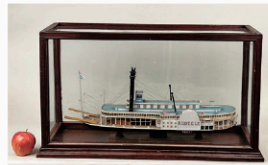
Cased Paddlewheel Model Robert E. Lee