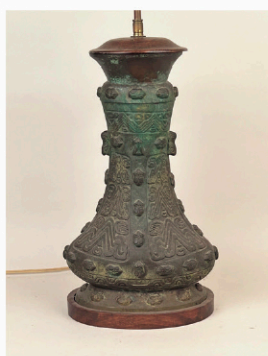
Japanese Bronze Vessel, As Lamp