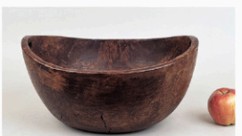
Large Antique Burl Maple Bowl