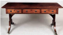
Regency Inlaid Mahogany Sofa Table