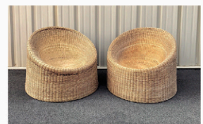
Pair Eero Aarnio MCM Wicker Elephant Boot Chairs