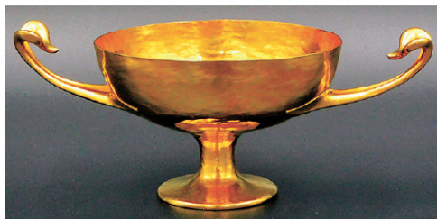
18kt. gold cup, Marcus & Co.

— OVER 800 LOTS, MOSTLY ALL UNRESERVED —