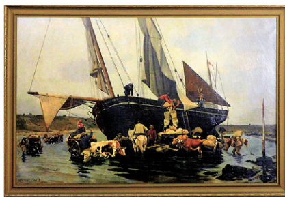
Clement Nye Swift, 50 x 78