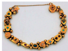
14kt., with precious & semi-precious stones