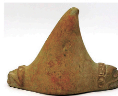
Large Taino Zemi