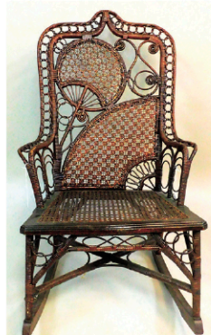
Rare 1880s theme back rocker