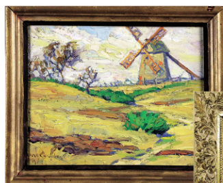
2 of 6 Anne Ramsdell Congdon Paintings