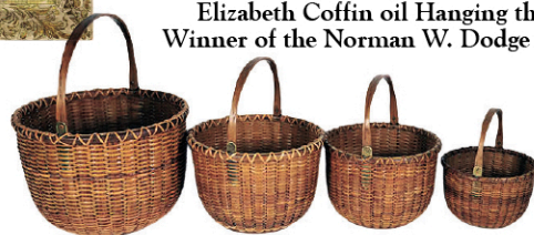
26 Nantucket Baskets