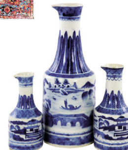
28 Lots of Canton