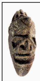
Sample of Ancient Stone Figures