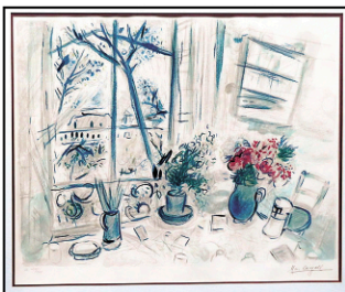
Mark Chagall signed Litho.