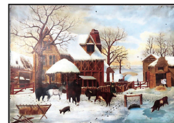
Sample of Country Artwork

HYDE PARK COUNTRY AUCTIONS • 845-471-5660 • 900 Dutchess Turnpike, Poughkeepsie NY