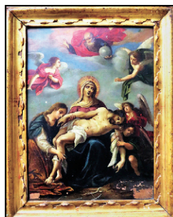
Lamentation of Jesus – 17th C.