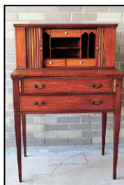
Sample of Custom Furniture