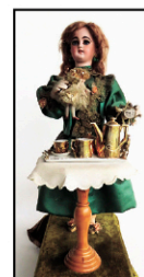
Automaton German Doll