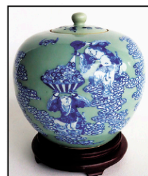
Sample of Chinese Export