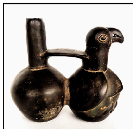
Sample of Ancient Peruvian Pottery