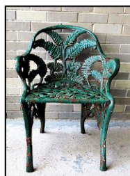
Cast Iron Fern Chair