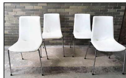
Signed DeSede Leather Chairs