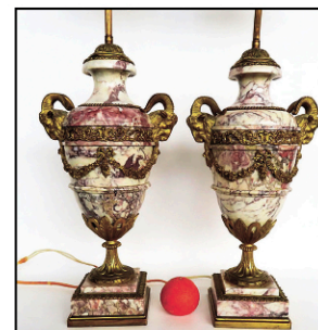
Bronze and Marble Urns