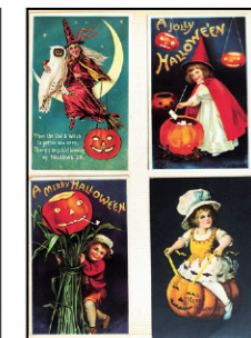
Sample of Postcards