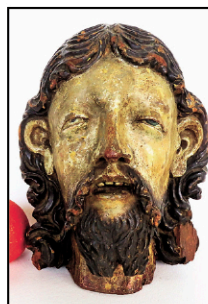
Sample of Ancient Art