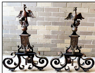
Sample of Hearth Items