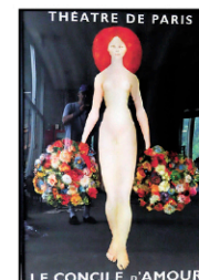
Sample of Posters