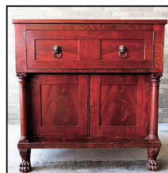
NY State Butler's Chest