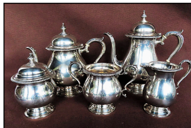
Sample of Sterling Silver