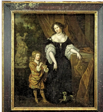
Attr. to Caspar Netscher (Netherlands 1639-1684)