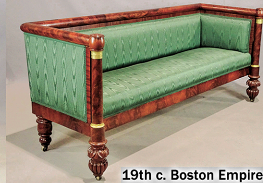
19th c. Boston Empire Mahogany Sofa