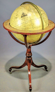
Floor Globe "Sir Joseph Banks" 42" Ht.