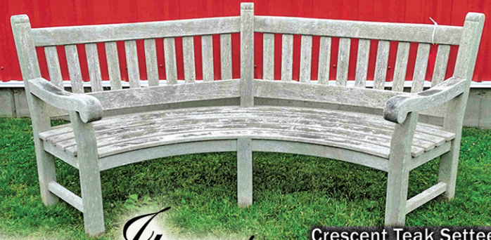
Crescent Teak Settee