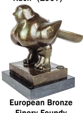
European Bronze Finery Foundy