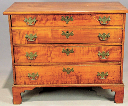
18th c. Chippendale Chest