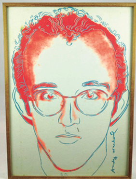
Andy Warhol Keith Haring T-Shirt