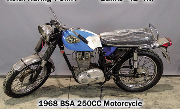
1968 BSA 250CC Motorcycle