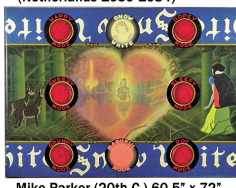
Mike Parker (20th C.) 60.5" x 72"