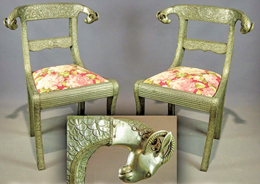
Pair Anglo-Indian Rams Head Chairs