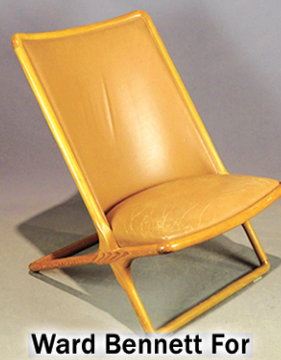
Ward Bennett For Brickell Scissor Chair