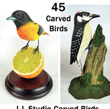
45 Carved Birds