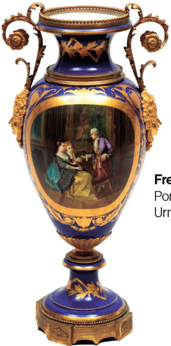
French Sevres Porcelain Double-Handed Urn, 19th C. H 36.5" Dia. 17.5"