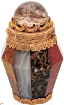
French Agate & Gold Vinaigrette H 2.2"