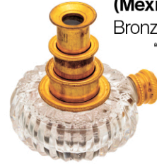
French Baccarat! Monocular Crystal Perfume - Snuff Bottle, Fitted