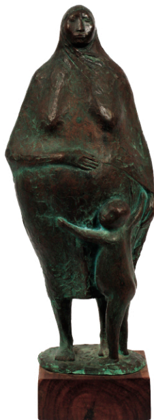
Francisco Zúñiga (Mexican, 1912-1998) Bronze Sculpture, 1960 "Madre Con Nino" H 17" W 7.5"