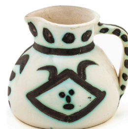
Pablo Picasso (Spanish, 1881-1973) White Earthenware Ceramic Plate & Pitcher, 1963 Tetes, Visage No. 0 (A.R. 458, 368)