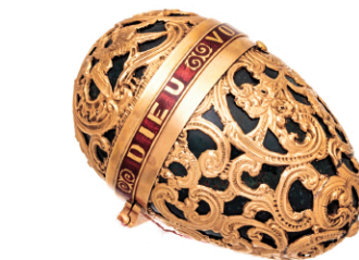
Gold And Nephrite Jade Easter Egg Shaped Box H 2.2" W 1.5"