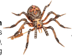
Spider Brooch Gold, Rubies, Diamonds Russian Style Ca. 1900, W 2.5" 19.8g