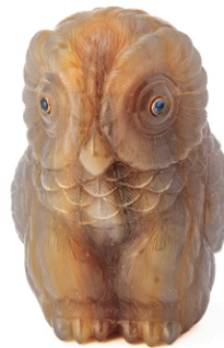
Russian Faberge Carved Opalescent Chalcedony Owl, Sapphire Eyes H 3.2" L 2.5" 340g