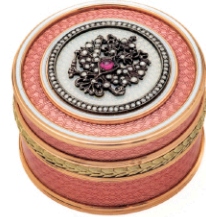
Russian 14kt Gold Guilloche Enamel Round Box Dia. 2" 123g