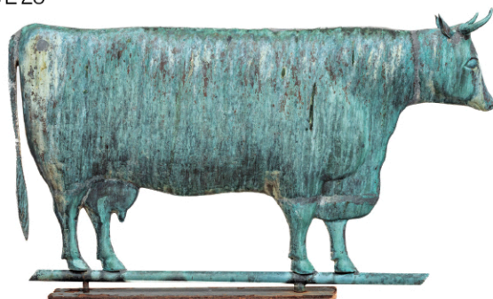
American Bull Form Copper Weather Vane, Ca. 1900, H 23.5" W 7" L 40"