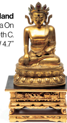
Thailand Gilded Bronze Buddha On Lotus Plinth Ca. 19th C. H 8" W 4.7"