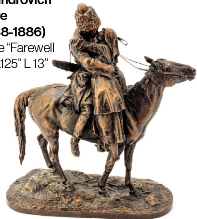
Evgeny Aleksandrovich Lansere (Russian, 1848-1886) Bronze Sculpture "Farewell Kiss", H 16" W 6.125" L 13"