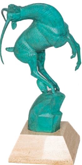
Marshall Fredericks (American, 1909-1998) Bronze Sculpture "Leaping Gazelle" H 31" W 20" Depth 12"