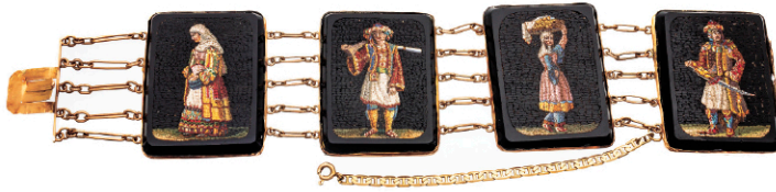
Micro Mosaic Bracelet 14K Gold, Ca. 1900, L 7" 72g