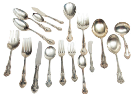
Gorham "English Gadroon" Sterling Silver Flatware For 20