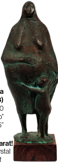
Francisco Zúñiga (Mexican, 1912-1998) Bronze Sculpture, 1960 "Madre Con Nino" H 17" W 7.5"