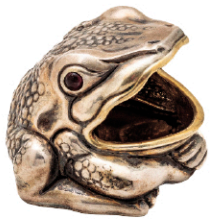
Imperial Russian Silver Figural Frog Box, Rappoport H 2.1" W 3" L 2.7" 2.7t oz