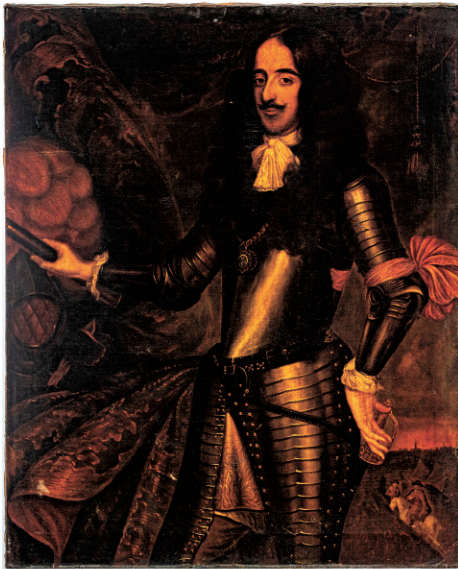
European Oil On Canvas, Ca. Late 17th C., King Charles II In Exile Wearing The Badge Of The Order Of The Garter, H 48" W 38"