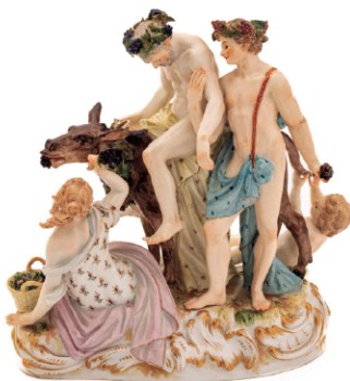
Meissen (German) Hand Painted Porcelain Figural Grouping, Ca. Late 19th Century "Drunken Silenus On A Donkey" H 8.5" W 8.5"