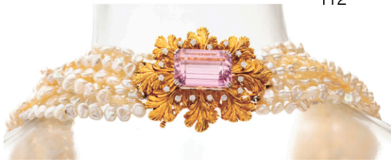
McTeigue 18kt Yellow Gold, Platinum, Diamond, & Rhodolite Garnet Torsade Pearl Necklace L 25"