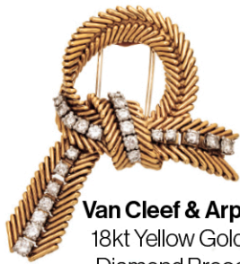
Van Cleef & Arpels 18kt Yellow Gold & Diamond Brooch H 2"