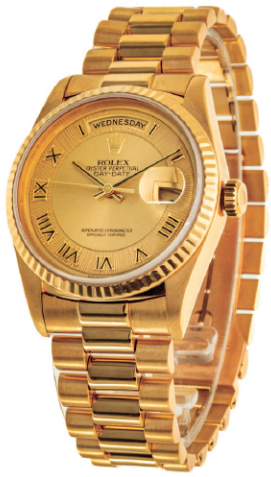
Rolex Paris 18kt Gold Superlative Chronometer Oyster Perpetual Day-Date Watch, 140g