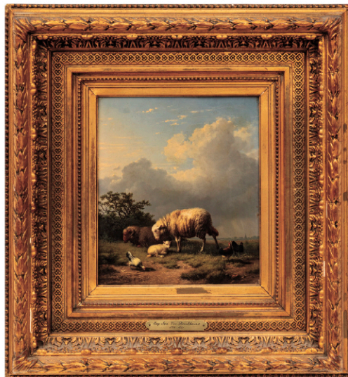
Eugene Joseph Verboeckhoven (Belgian, 1798-1881) Oil On Beveled Mahogany Panel Ca. 1854 Landscape With Sheep H 9" W 8"