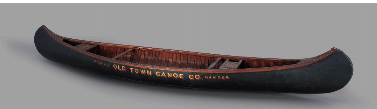
Salesman's Sample Canoe, Old Town Canoe Company (1903-present), Old Town, ME, c. 1925, 48 in. long