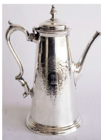
George Richmond Collis London Silver Ca 1850 for the SC Market