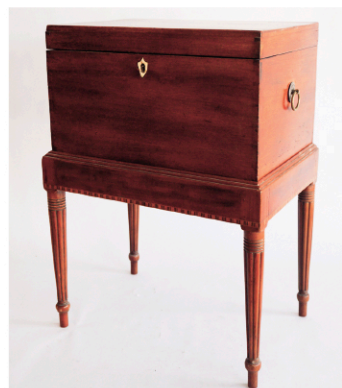
Fine Southern Federal Mahogany & Poplar Cellarette on Frame