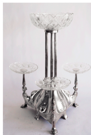
Very Fine German Art Nouveau Silver Plate Epergne Wurttembergische Metallwarenfabrik ca 1912