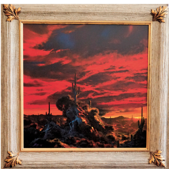
Dale TerBush California / Arizona b. 1948