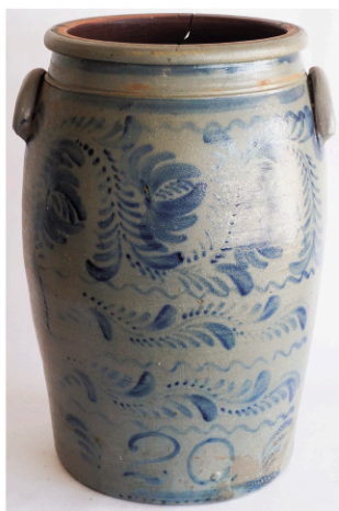
Munumental 20 Gal Western PA Storage Jar