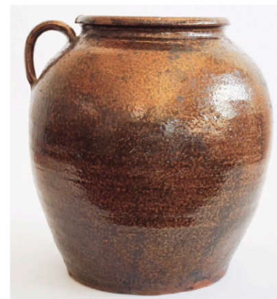
Edgefield District Storage Jar Stoney Bluff Ca 1850 Possibly By David Drake