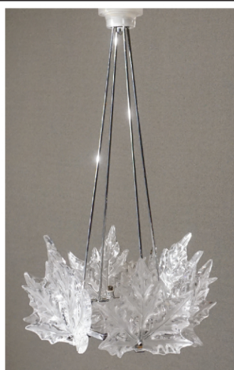
Lalique 'Champs-Élysées' Six-Light Single-Tier Chandelier, Model 10112, Post 1978, $4,000-$6,000