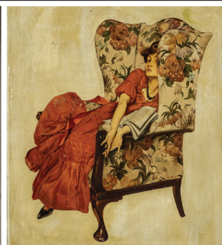
Frank Xavier Leyendecker (American, 1877-1924), Woman Seated in a Wing Armchair , oil on canvas, $10,000-$20,000