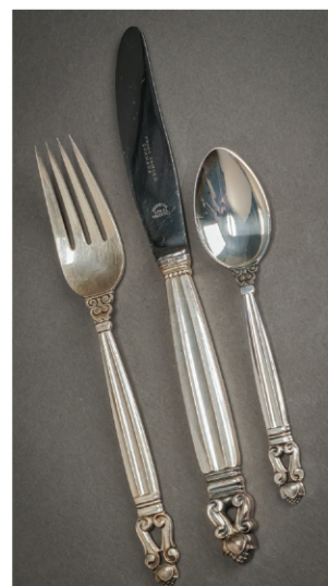
Georg Jensen Sterling Flat Table Service for Sixteen, Acorn Pattern , $3,000-$5,000