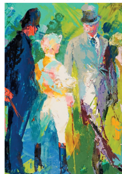
LeRoy Neiman (American, 1921-2012), English Paddock , oil on board, $20,000-$25,000