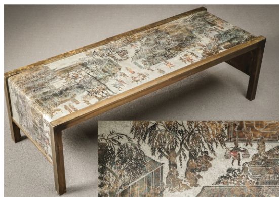
Philip & Kelvin LaVerne 'Spring Festival' Coffee Table, New York, 1960s, $5,000-$7,000