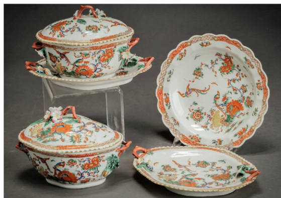
Pair of Worcester Porcelain Kakiemon Palette Covered Tureens with Undertrays and a Dish, Phoenix Pattern , Dr. John Wall Period (Circa 1765), $800-$1,200