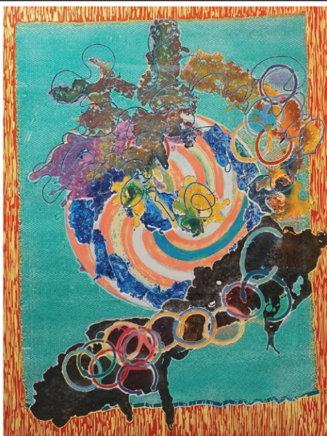
Frank Stella (American, b. 1936), Juam: State I: From Imaginary Places , relief, woodcut, etching and aquatint with hand-coloring on TGL handmade paper, $10,000-$15,000