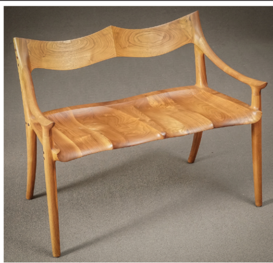
Sam Maloof (American, 1916-2009) Carved Walnut Low Back Settee, 1984, $15,000-$20,000