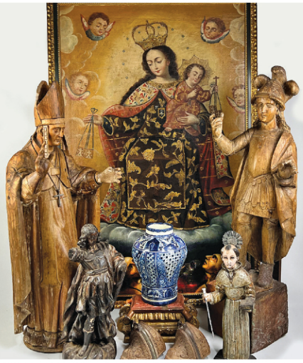
A PRIVATE COLLECTION OF SPANISH COLONIAL ECCLESIASTICAL AND SECULAR ITEMS INCL. SILVER, OBJECTS AND WORKS OF ART THIS IS THE SIXTH AND FINAL INSTALLMENT FROM A CONNECTICUT GENTLEMAN.

PREVIEWS AT THE CRN GALLERY: FRIDAY, APRIL 21 FROM 10 A.M. TO 5 P.M. SATURDAY, APRIL 22 FROM 10 A.M. TO 3 P.M. ALSO BY APPOINTMENT LIMITED PREVIEW MORNING OF SALE