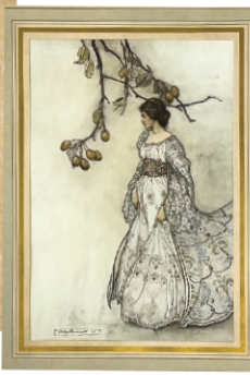
ARTHUR RACKHAM J.M. BARRIE'S PETER PAN OVERSIZED LIMITED EDITION PORTFOLIO NO. 4 OF 100 TWO OF TWELVE PLATES ALL SIGNED BY RACKHAM ONLY 20 OF THE 100 EDITIONS WERE SIGNED BY RACKHAM

The Peter Pan Portfolio. by Arthur Rackham. from Peter Pan in Kensington Gardens. by J.M. Barrie Hodder & Stoughton LONDON