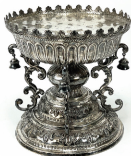
SILVER PEANA, MEXICO, 9 IN. H