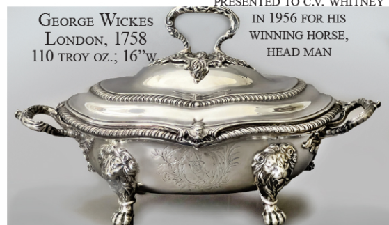
GEORGE WICKES LONDON, 1758 110 TROY OZ.; 16"W