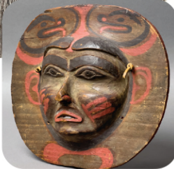
NOOTKA MAKAH HAIDA BASKETRY HAT