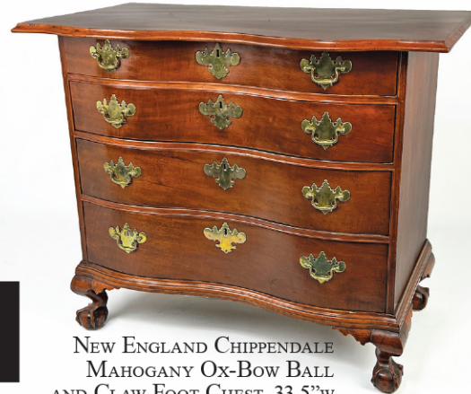
NEW ENGLAND CHIPPENDALE MAHOGANY OX-BOW BALL AND CLAW FOOT CHEST, 33.5" W

SEE OUR WEBSITE FOR ON-LINE CATALOGUE: www.crnauctions.com