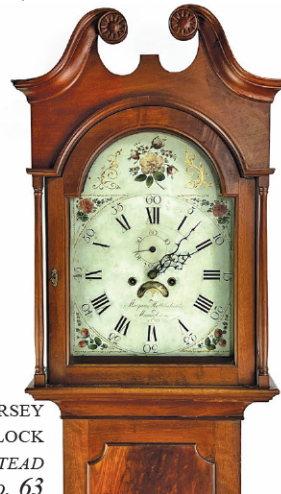
AN IMPORTANT NEW JERSEY MAHOGANY CASED TALL CLOCK SIGNED: MORGAN HOLLINSTEAD MOORESTOWN No. 63