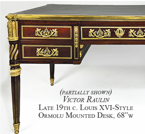
(PARTIALLY SHOWN) VICTOR RAULIN LATE 19TH C. LOUIS XVI-STYLE ORMOLU MOUNTED DESK, 68" W