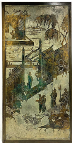
(TOP SHOWN ONLY) PHILIP & KELVIN LAVERNE BRONZE COFFEE TABLE, 48"