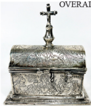
SILVER CHRISMATORY CASSET W/ OVERALL ETCHED PORTRAITS, 4.5 IN. W

THE SIXTH INSTALLMENT FROM A CONNECTICUT GENTLEMAN