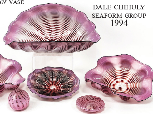
DALE CHIHULY SEAFORM GROUP 1994