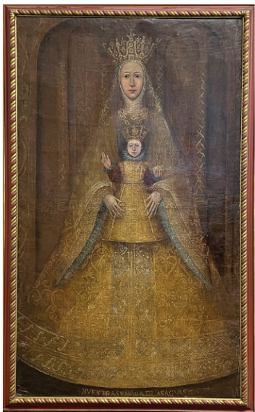
SPANISH COLONIAL/COLUMBIA LATE 16TH C. NUESTRA VIRGEN DE LAS AGUAS OIL/CANVAS, 75 IN. BY 45 IN.