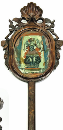
REVERSE PAINTED GLASS AND CARVED PARADE BANNER SAN MIGUEL 33" OVERALL