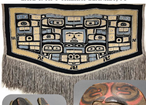
LATE 19TH C CHILKAT BLANKET, 51"