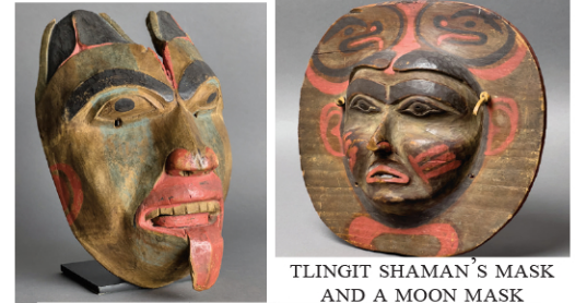
TLINGIT SHAMAN'S MASK AND A MOON MASK