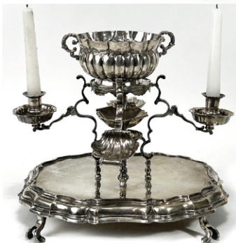
RARE 18TH C. SILVER CENTERPIECE GUATEMALA, 9.5 IN. H