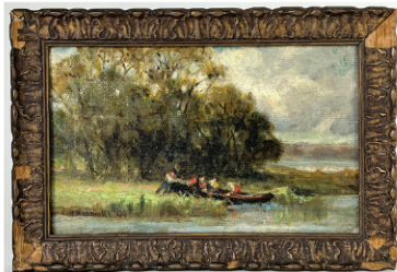
EDWARD M. BANNISTER (CANADA/RI, 1828-1901) OIL/CANVAS, 5 BY 8 IN.