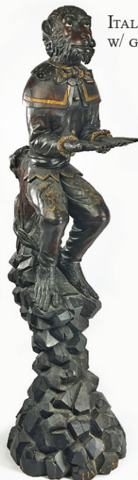
ITALIAN CARVED MONKEY W/ GLASS EYES, 52.5" TALL