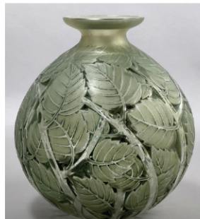
LALIQUE MILAN VASE 1929, 11"