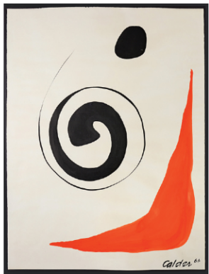
ALEXANDER CALDER (1898-1976) GOUACHE AND INK ON PAPER, 1966 30.5 BY 23 IN.