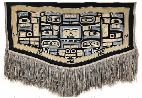
A NORTHWEST COAST PRIVATE COLLECTION INCL. (ABOVE) LATE 19TH C CHILKAT BLANKET, 51"