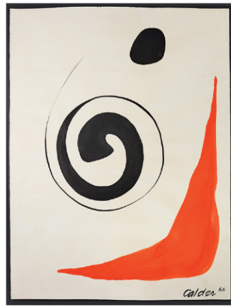
ALEXANDER CALDER (1898-1976) GOUACHE AND INK ON PAPER, 1966 30.5 BY 23 IN.