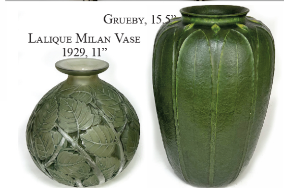
LALIQUE MILAN VASE 1929, 11"