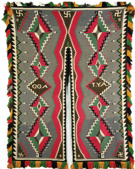
UNIQUE NAVAJO GERMANTOWN PORTIERE, 7' BY 5'