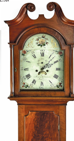
NEW JERSEY MAHOGANY CASED TALL CLOCK MORGAN HOLLINSHEAD MOORESTOWN No. 63