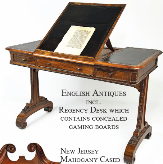
ENGLISH ANTIQUES INCL. REGENCY DESK WHICH CONTAINS CONCEALED GAMING BOARDS