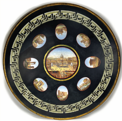
ITALIAN GRAND TOUR MICRO MOSAIC, 26" DIAM.

ALSO BY APPOINTMENT LIMITED PREVIEW MORNING OF SALE