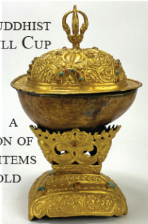
TIBETAN BUDDHIST RITUAL SKULL CUP

PART OF A COLLECTION OF BUDDHIST ITEMS BEING SOLD