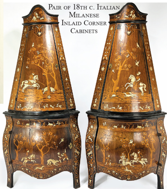
PAIR OF 18TH C. ITALIAN MILANESE INLAID CORNER CABINETS