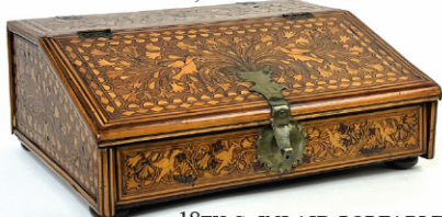
18TH C. INLAID PORTABLE WRITING DESK, PERU