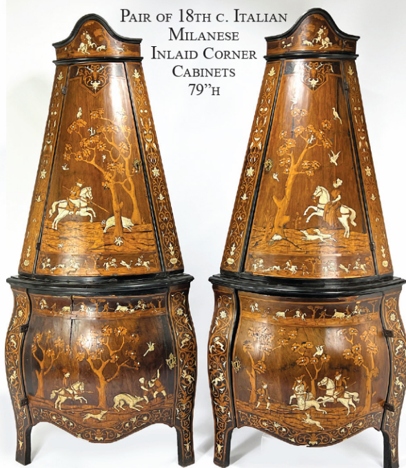
PAIR OF 18TH C. ITALIAN MILANESE INLAID CORNER CABINETS 79" H