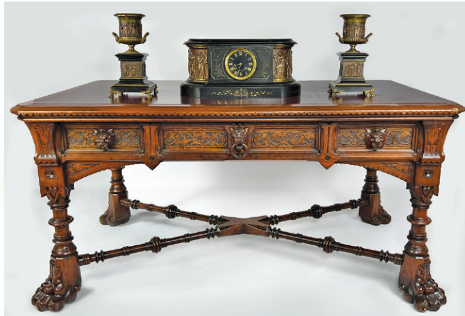
RENAISSANCE REVIVAL ORNATELY CARVED WALNUT PARTNER'S DESK DANIEL PABST, C. 1870, 60"W BRONZE AND SLATE CLOCK SET MADE FOR THE 1889 PARIS EXPOSITION BY NAPE FRERES ET CIE, PARIS, SIGNED TIFFANY