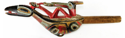
TLINGIT OR HAIDA RAVEN RATTLE, 13"