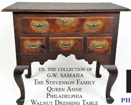
EX. THE COLLECTION OF G.W. SAMAHA THE STEVENSON FAMILY QUEEN ANNE PHILADELPHIA WALNUT DRESSING TABLE IN UNTOUCHED CONDITION