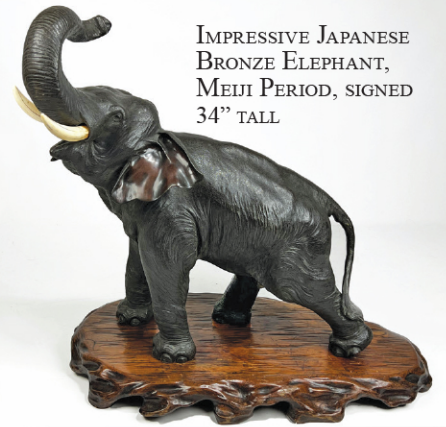
IMPRESSIVE JAPANESE BRONZE ELEPHANT, MEIJI PERIOD, SIGNED 34" TALL