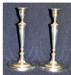
Crichton H: 11 1/2"