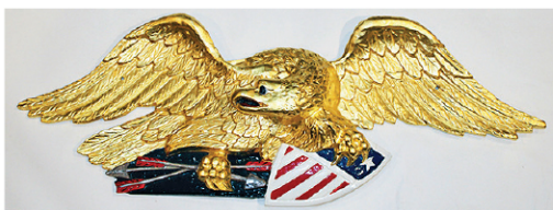
wrought iron, W: 39"