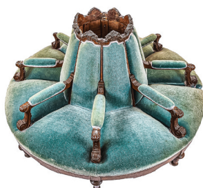
Borne Settee from the Steamer Vermont