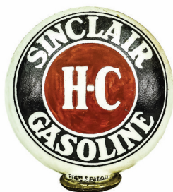
Period Sinclair H-C Gas Pump Globe