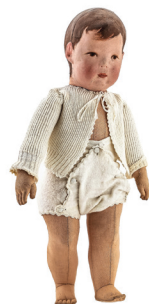
Early Kathe Kruse Type 1 Doll