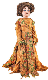
Simon and Halbig 159 Fashion Lady