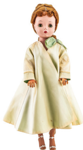
1956 Madame Alexander Cissy