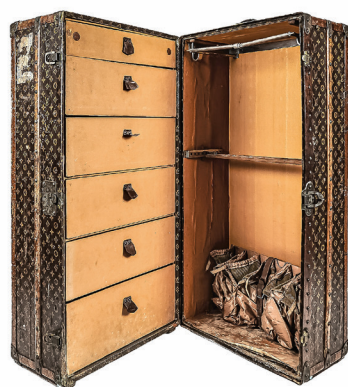
Louis Vuitton Wardrobe Trunk