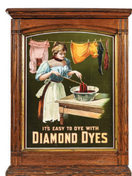
Tin Litho Diamond Dye Cabinet