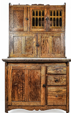
"Hoosier Saves Steps" Labeled Baker's Cabinet