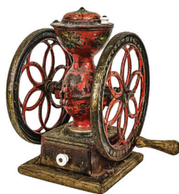
Collection of 20+ Coffee Grinders