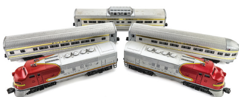
Lionel Presidential Special Train Set