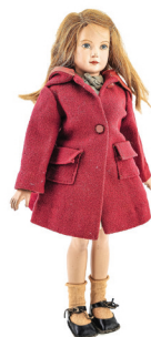
1947 Dewees Cochran Cindy Doll