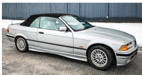
1998 BMW 323i Convertible