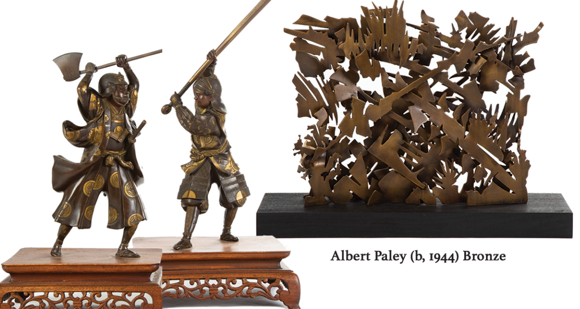
Japanese Mixed Metal