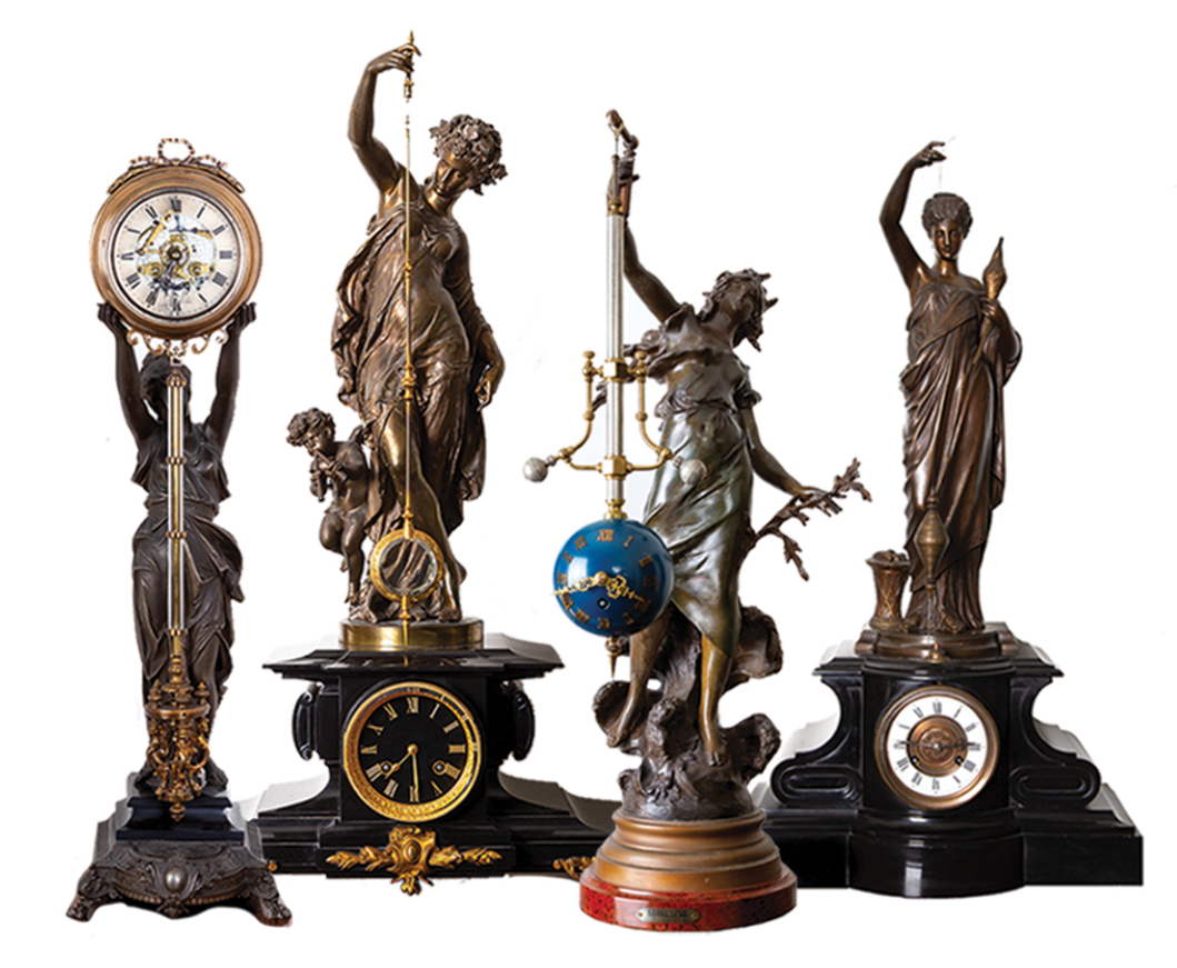
Fine and Rare 19th Century French Mystery Clocks