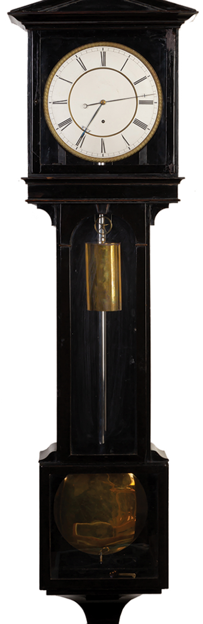
Biedermeier 'Laterndluhr' Vienna Regulator