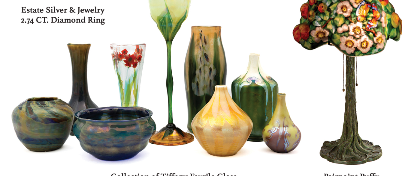
Collection of Tiffany Favrile Glass