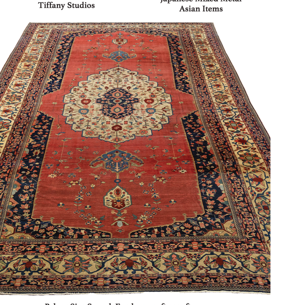
Palace Size Sarouk Farahan - 21 ft. x 13 ft. (Several Antique Rugs)