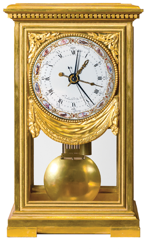
Exceptional Louis XVI Regulator Robin & Coteau, circa 1785