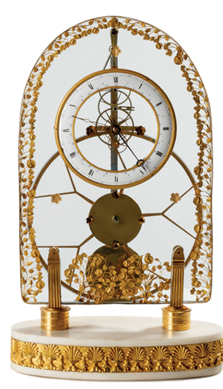
French Empire Glass-Plated Skeleton, circa 1815