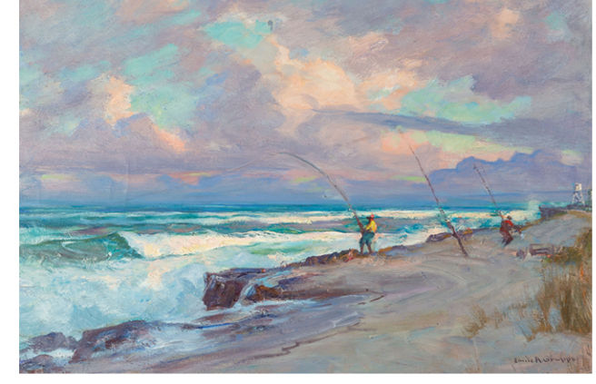
Emile Gruppe (1 of several)