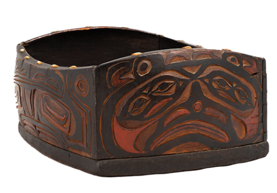
19th C. Northwest Coast Feast Bowl