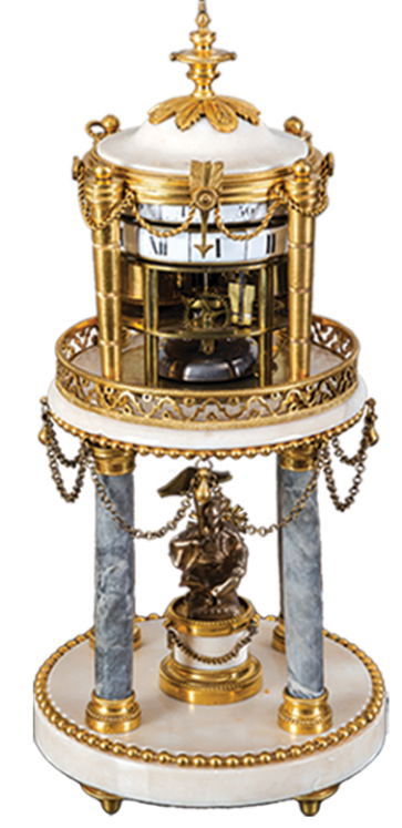
Louis XVI Cercles Tournants Gille A Paris, circa 1775