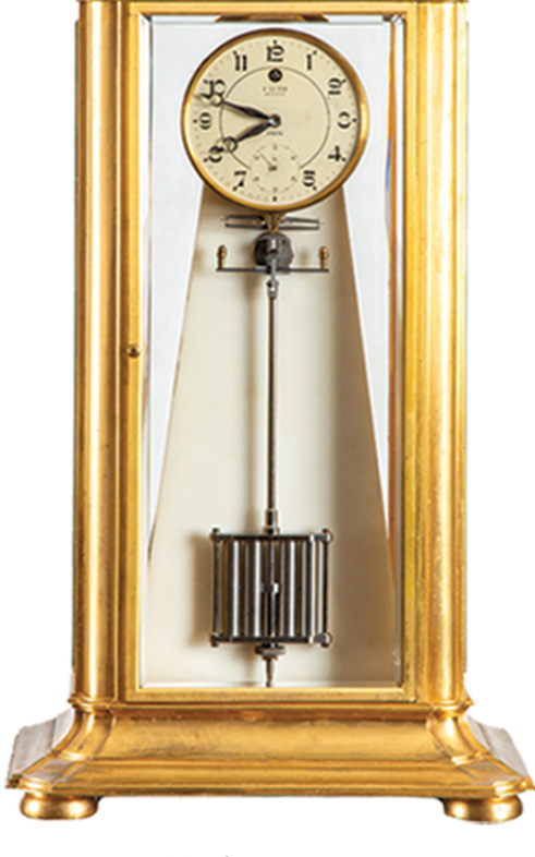
Rare F. Luthi Constant Force Regulator, circa 1920