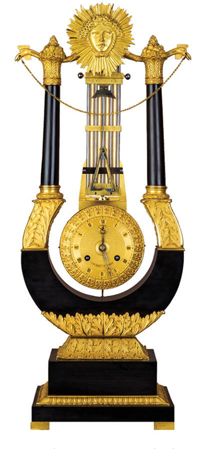
French Empire Lyre Clock A. Courbet, circa 1815