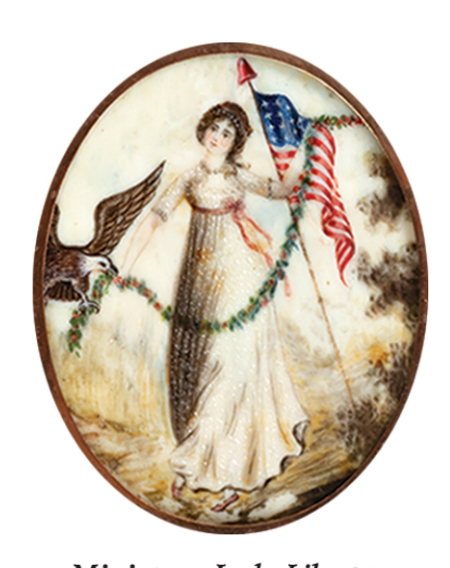
Miniature Lady Liberty signed Abijah Canfield, April 1797