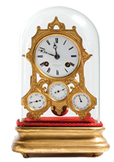
Raingo Frères, circa 1830