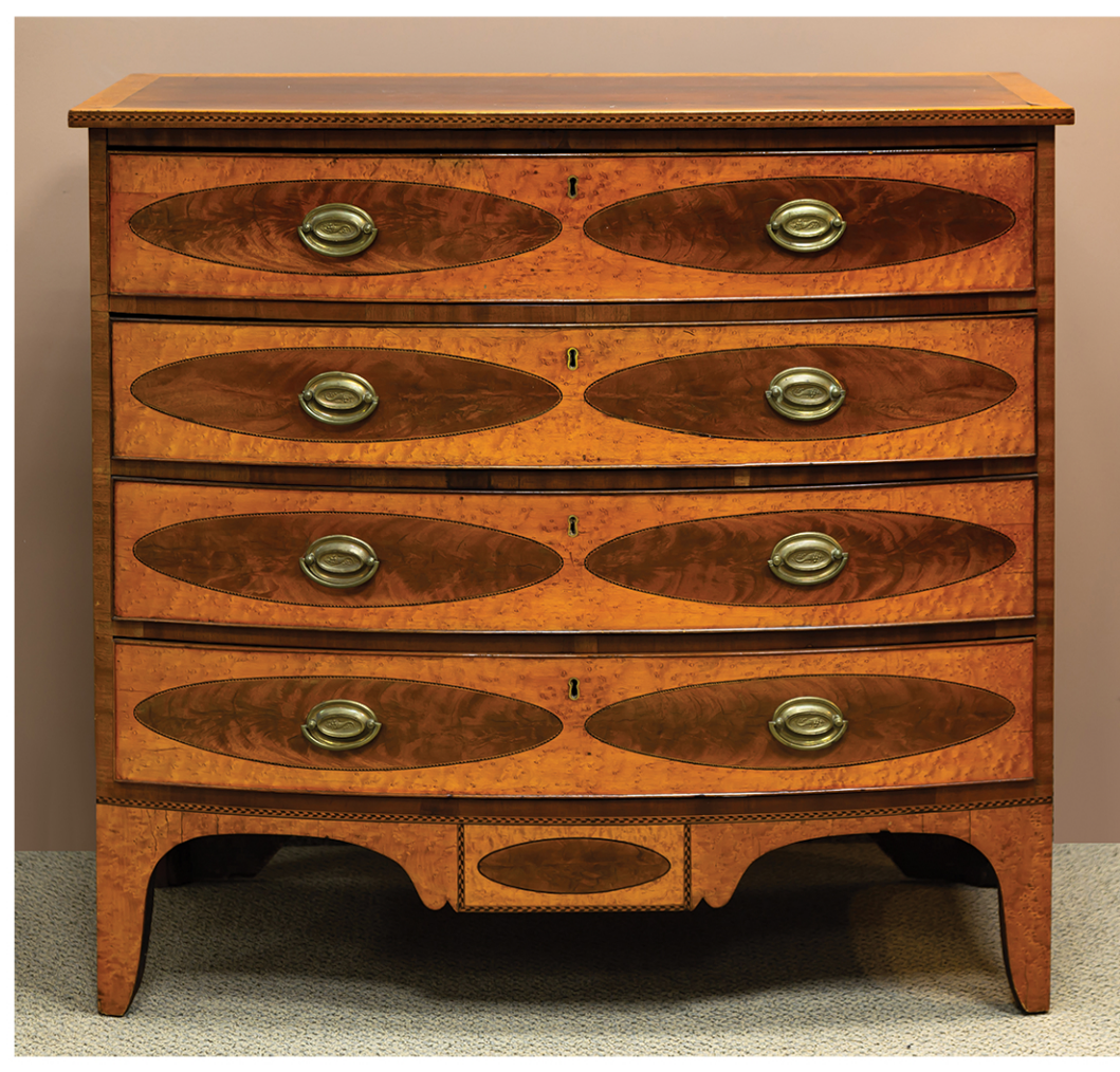
Federal Satinwood & Mahogany Bow-Front Chest of Drawers, Saco, Maine, 1812