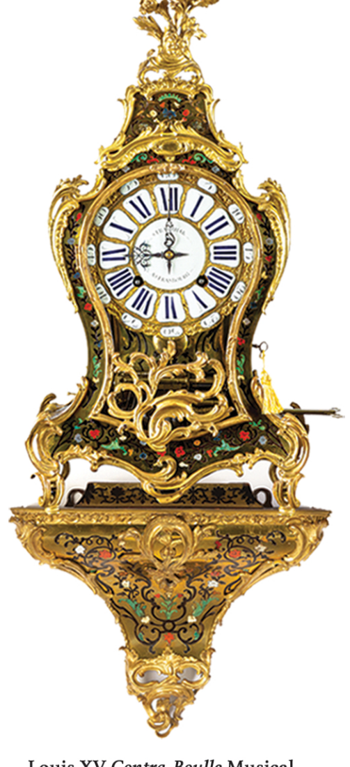
Louis XV Contra-Boulle Musical Clock & Bracket, circa 1740