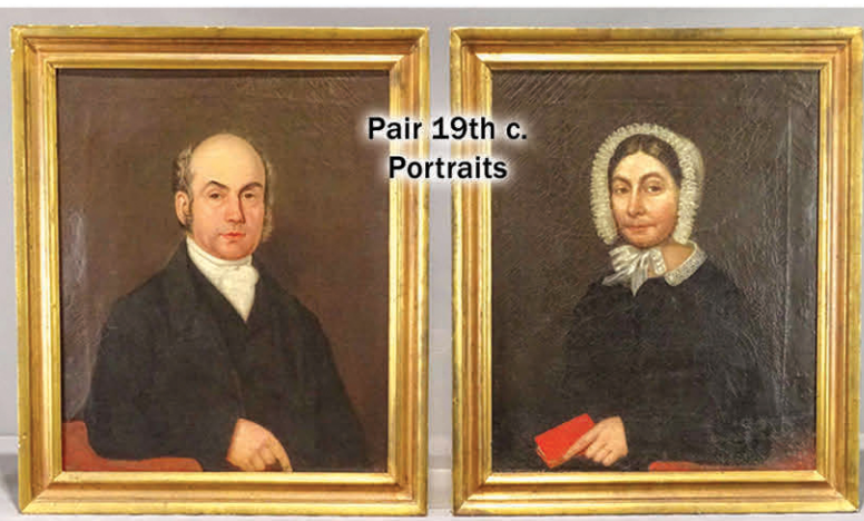
Pair 19th c. Portraits