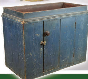
19th c. Drysink