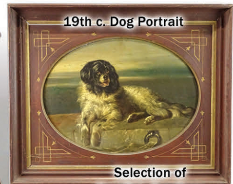
19th c. Dog Portrait