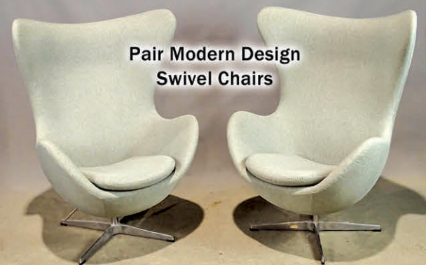
Pair Modern Design Swivel Chairs