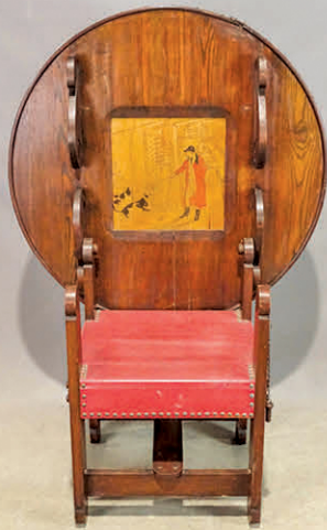
English Arts & Crafts Table