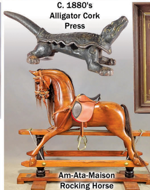
C. 1880's Alligator Cork Press