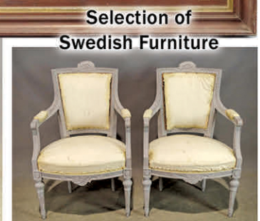
Selection of Swedish Furniture

PREVIEW & BID ONLINE : WWW.COPAKEAUCTION.COM