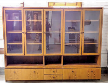
Musterring Dining Room Set