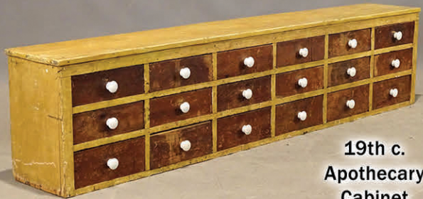
19th c. Apothecary Cabinet