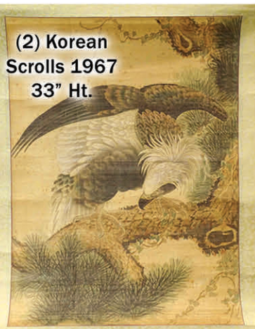
(2) Korean Scrolls 1967 33" Ht.