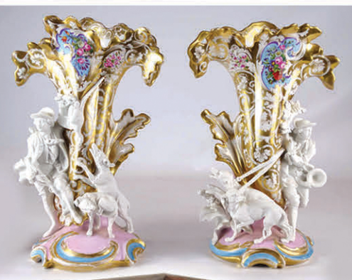
Pair of Old Paris Vases