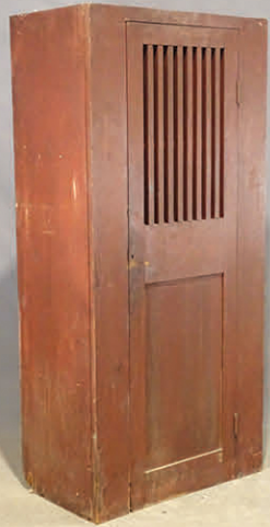
19th c. Cupboard