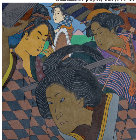
Roger Shimomura (American, b. 1939), Rambo 12 , oil on canvas, $4,000-$6,000