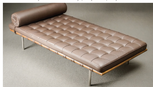
Mies van der Rohe 'Barcelona' Couch Daybed, Knoll International, Circa 1990-2000, $1,000-$2,000