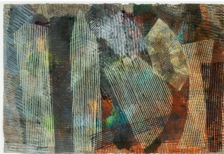
Sam Gilliam (American, 1933-2022), Untitled , acrylic and mixed media on handmade paper, $25,000-$35,000