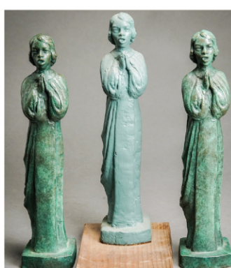
Augusta Savage (American, 1892-1962), Singing Women: Three Works , green painted plaster sculpture together with two later bronze casts of mold, $5,000-$10,000