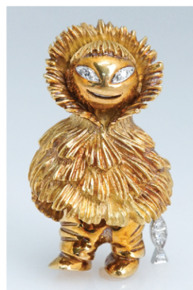
Cartier 18-Karat Yellow-Gold and Diamond Brooch, $3,000-$5,000