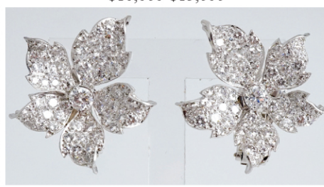
Pair of Van Cleef & Arpels Platinum and Diamond French Clip-Back Pierced Earrings, Circa 1965, $10,000-$15,000

♦ In-Person Exhibition: Saturday, March 4, 10am to Noon;