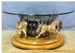
Revolving Carousel table