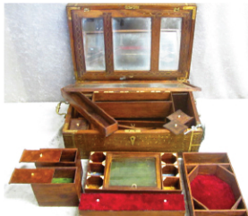
19c Traveling Box