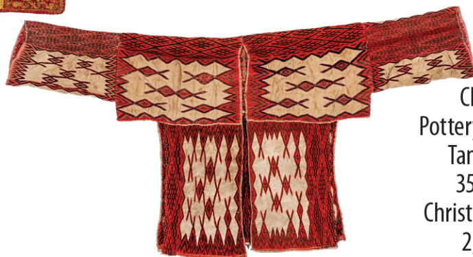
Rare Miao Man's Coat, Guizhou Province, China, Early 20th C.