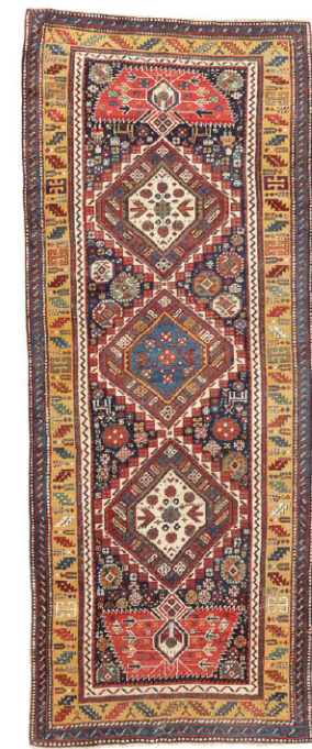
Fine Karagashli Rug, Caucasus, Ca. 1875