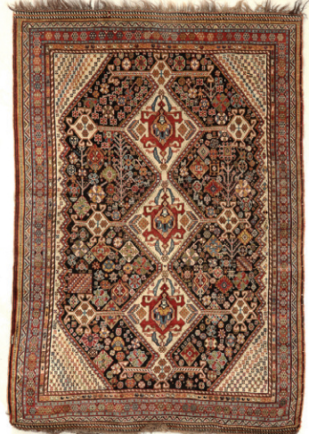
Gashgai Rug, Persia, Ca. 1875