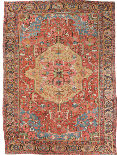
Heriz Rug, Persia, Late 19th C.