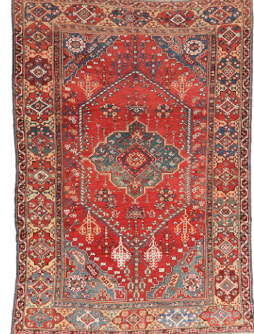
Dazkiri Rug, Turkey, Ca. 1800