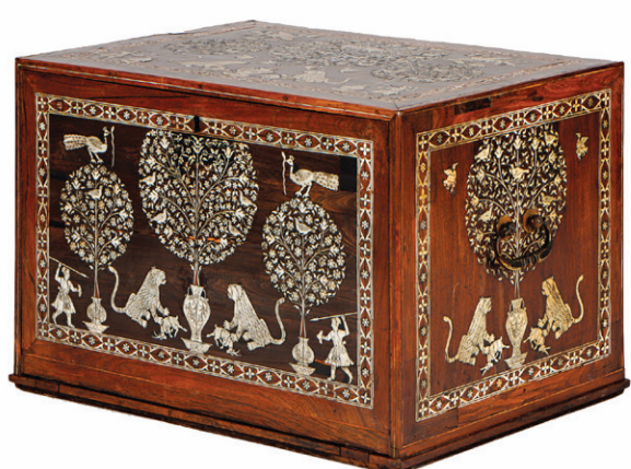
Royal Mughal Inlaid Fall-Front Cabinet, India, Gujarat, Late 16th C.