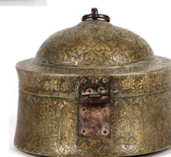
Fine Mughal Engraved Brass Pandan, Rajasthan, Possibly Tanjore, 17th C.