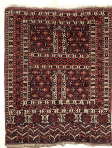
Chodor Ensi Rug, Turkmenistan, Mid 19th C.