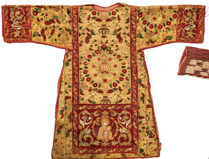
Fine 15th/16th C. Continental Ecclesiastic Robe/Vestment

Live Showroom Auction: Monday, March 13, 2023, 10AM | Public Exhibition: March 10-11-12, 11AM - 4PM