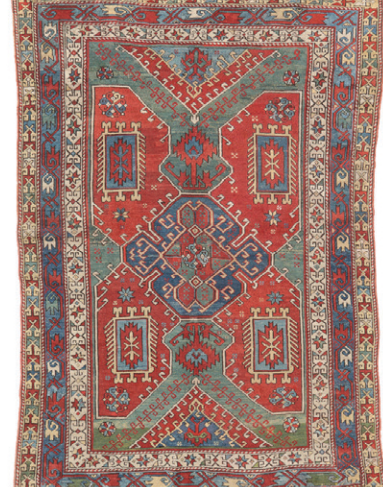
Bergama Rug, Turkey, Ca. 1800