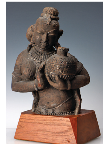
Sandstone Sculpture, Northern India, C. 15th C.