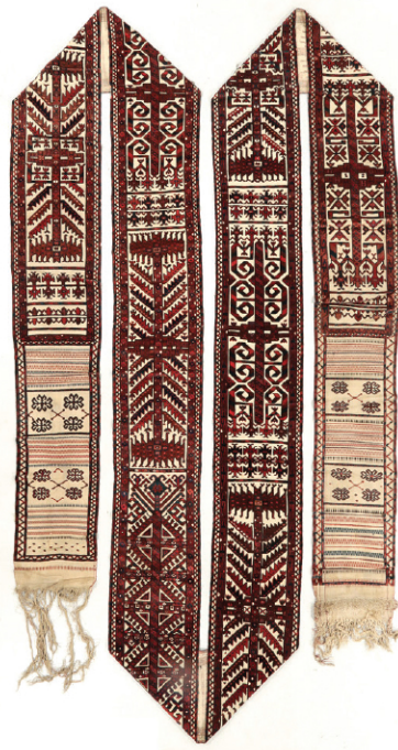
Complete Yomud Tent Band, Turkmenistan, 19th C., L: 43'0"