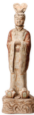
Chinese Painted Pottery Court Figure, Tang Dynasty, Ht. 35". Provenance: Christie's, December 2, 2003, Lot 168