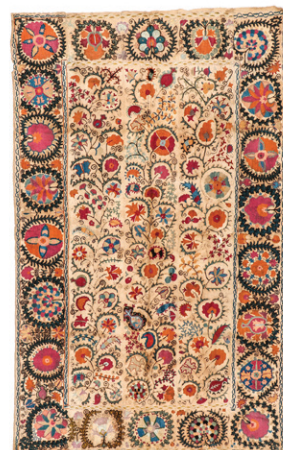
Central Asian Suzani, 19th C.