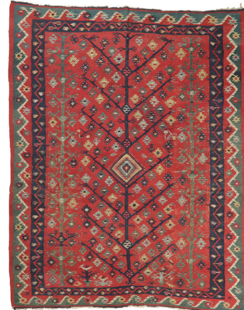
Sarkoy Kilim, Serbia/Bulgaria, 19th C.