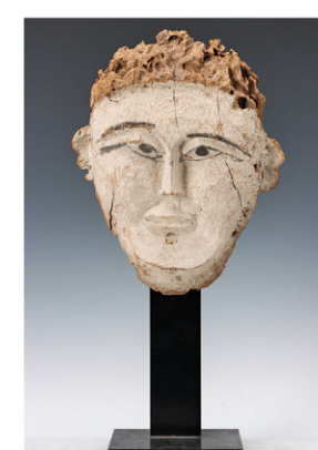
Ancient Egyptian Wood Mask, Carved wood and Pigment