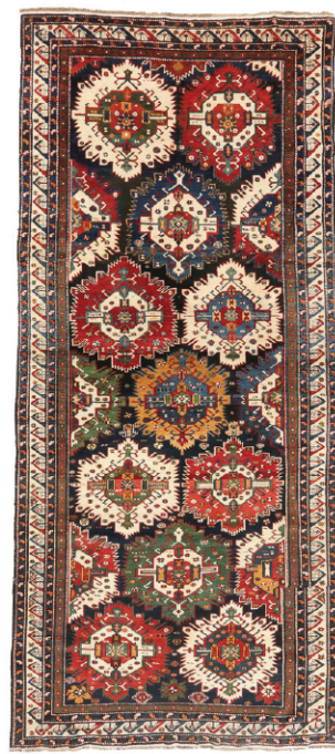
Fine Kuba Zeikhur Rug, Caucasus, Late 19th C.