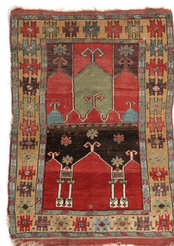
Konya Prayer Rug, Central Anatolia, Ca. 1800