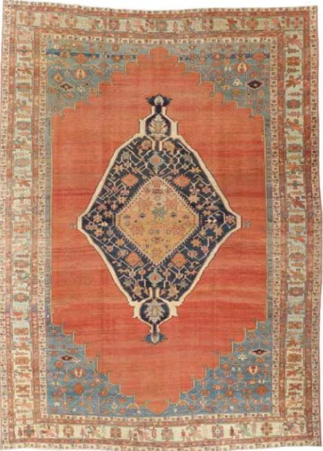
Serapi Rug, Persia, Ca. 1875