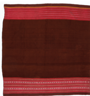
Aksu, Department of Puno or Moquegua, Peru Aymara Culture, C. 17th-18th C.