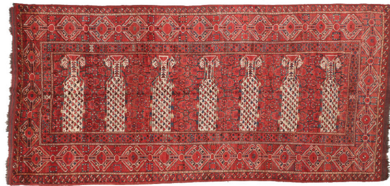
Ersari Saf Rug, Turkmenistan, 19th C.