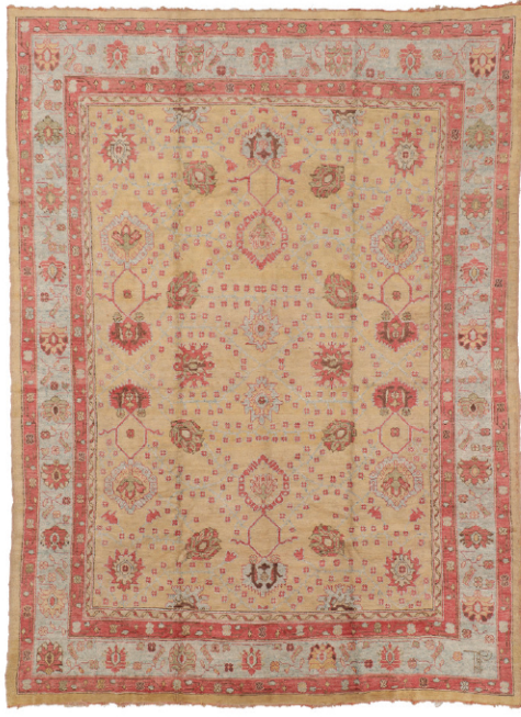
Oushak Rug, Turkey, Ca. 1900