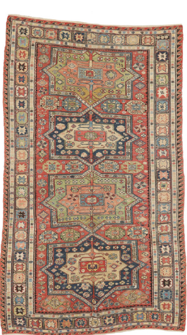
Sumak Rug, Caucasus, Ca. 1875

Join Us! Exhibition & Catered Reception, Sunday, February 26, 1PM – 4PM