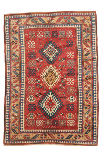
Kazak Rug, Caucasus, Ca. 1875