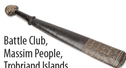
Battle Club, Massim People, Trobriand Islands, PNG, 19th/Early 20th C.