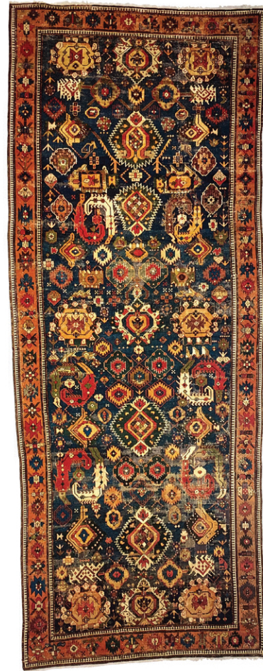
18th C. Karabagh Rug, Caucasus, 7'1" x 17'9" Ex. Heinrich Kirchheim Collection Plate 77, Orient Stars, Hali Publications, London, 1993