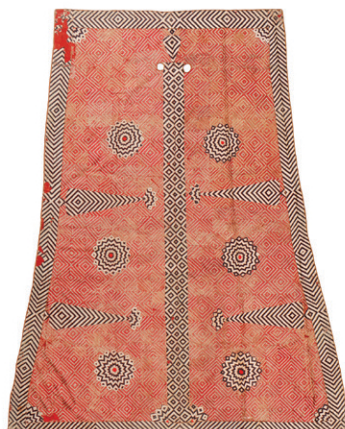
Rare Royal Mughal Silk Gauze Ceremonial Elephant Cover, C. 1800-1850