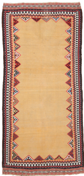
Fine Yellow Field Gashgai Kilim, Persia, 19th C.