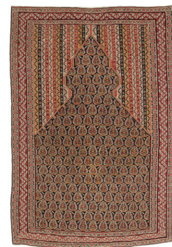
Fine Senneh Kilim, Persia, 19th C.