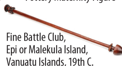
Fine Battle Club, Epi or Malekula Island, Vanuatu Islands, 19th C.