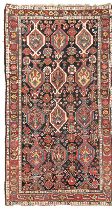
Northwest Persian Rug, Early/Mid 19th C.