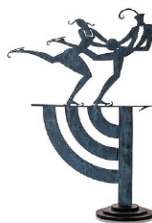
Hunt Diederich Weathervane