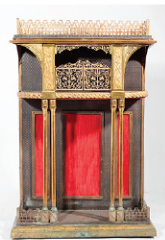
NY Metropolitan Museum Etagerie by Charles Parker Company