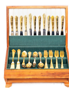
158-Piece, E. Dragsted, Danish Modern Silver Vermeil Flatware Service in the Antik Pattern