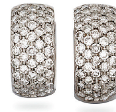
14kt White Gold and Diamond 'Huggie' Earrings