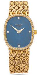
Patek Philippe Signed 18K and Diamond Golden Ellipse Wristwatch