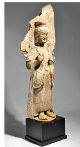
Ancient Monumental Chinese Stone Avalokite Shvara, The Bodhisattva of Compassion