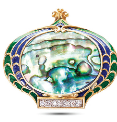
Rare Marcus & Company Art Nouveau 18k gold, diamond & enameled brooch