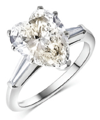
Platinum and 3+ Carat Diamond Solitaire Ring