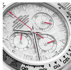
Rare Rolex Daytona Meteorite Face 18K Chronograph Wristwatch

ONLINE ONLY • Live Auctioneers and Invaluable • Preview by appointment only