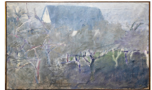
Signed Wolf Kahn, 'Young Apple Trees & Barn' Oil on Canvas, circa 1969, Gallery Label