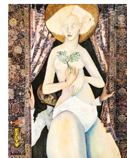
Signed Mylo Quam original painting and Paper Collage