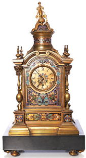
19th Century Bronze & Champeve Mantle Clock, German Works