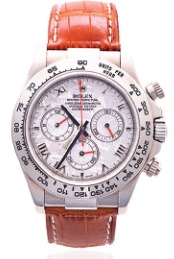
Rare Rolex Daytona Meteorite Face 18K Chronograph Watch