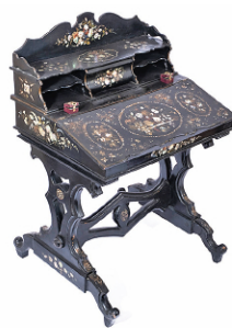
English Lacquer Writing Desk with Mother of Pearl Inlay