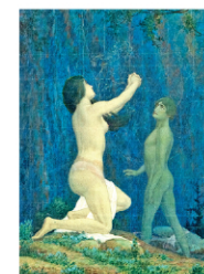
Signed Charles Holloway Watercolor Board