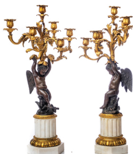
Circa 1900 Gilded and Patinated Bronze Candleabra