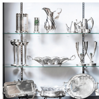
Fine Collection of Silver