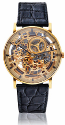
Rare Audemars Piguet Gold Automatic Skeletonized Wristwatch, Circa 1970