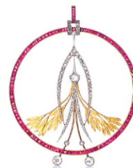
Antique 18K MASRIERA Y CARRERA Contemporary Art Nouveau ruby and diamond pendant