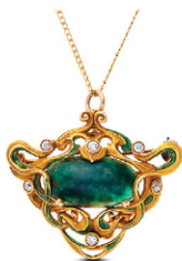
Antique Art Nouveau 18K and Emerald Brooch