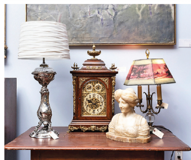
A selection of fine antiques