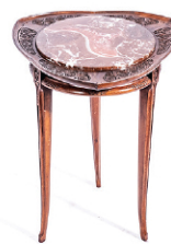
Majorelle Museum Quality Carved Gueridon, Signed