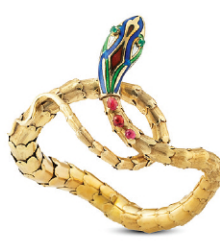
14K Gold, Enamel, and Gem-Set Snake Bracelet