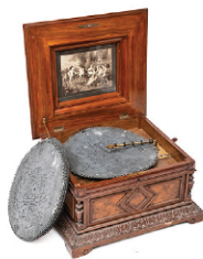
1890 Polyphon Music Box