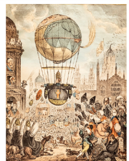
Rare James Gillray dated 1810 'He Steers His Flight' Etching, Aquatint & Watercolor

The first Premier Auction of the year sale is an extraordinary event with over 75% of items being offered without reserves. This auction is filled with great pieces, including a collection of Mettlach steins, a collection of fine clocks, an impressive collection of exceptional watches, an extensive collection of signed designer jewelry, an array of fine paintings by well-listed artists, gold, Art Nouveau and Deco silver, Swid Powell, Art glass, signed lamps, 18th, 19th, and 20th century antique furniture and decor, Frank Gehry, large scale ancient Chinese and other Asian stone carved temple figures, demons