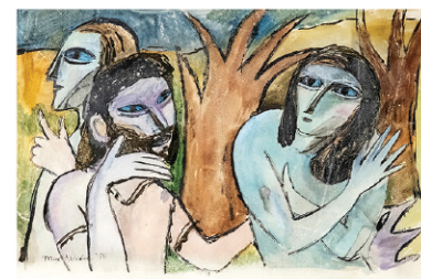
Signed Max Weber Watercolor Painting on Paper, 1910