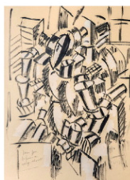
Large Signed Fernand Leger Lithograph