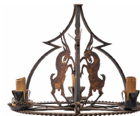
Hunt Diederich Hand crafted Iron Hanging Lamp