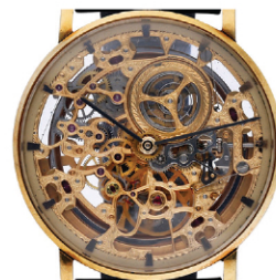
Rare Audemars Piguet Gold Automatic Skeletoized Wristwatch