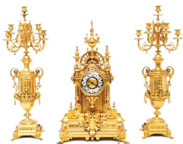
Antique 34" Three Piece French Monumental Gilt Brass Clock Garniture, c 1900