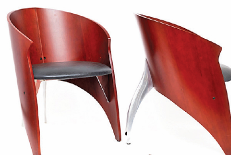
Pair of Designer Italian Formed Wood and Chrome Chairs