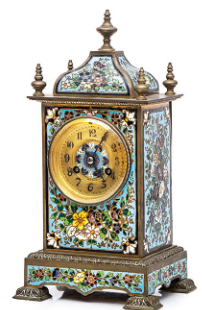
Tiffany & Co Signed Cloisonné Paneled Mantel Clock