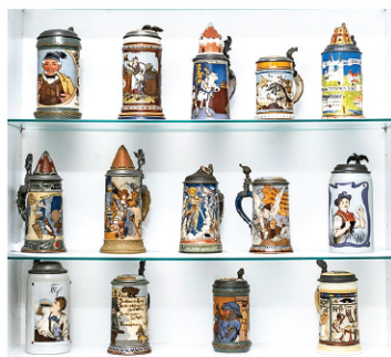
Collection of Mettlach Steins