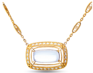
Louis Comfort Tiffany Moonstone and Plique-a-Jour Enamel Pendant Necklace