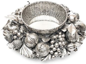
Extraordinary Signed Gianmaria Buccellati Fruit & Foliate Silver Centerpiece