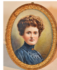
W/C Portrait Miniature Edwardian Beauty, 19th C., H. 3 1/2", W. 3"