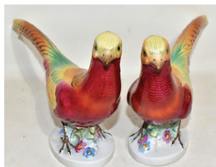
Herend-Hungary Porcelain Golden Pheasants, 19/20th C., H. 6 1/2, L. 13"