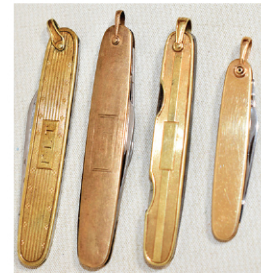
Lot (4) Art Deco 10/14kt Pocket Watch Fobs, 20th C., (3) 14kt, (1) 10kt