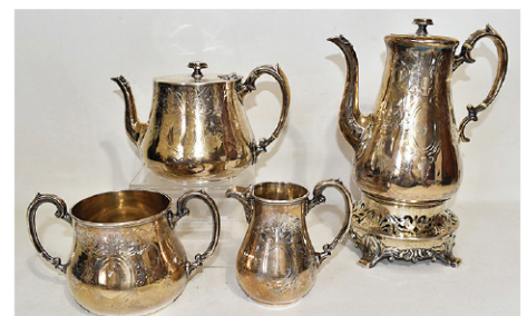
Set (4) London Sterling Silver Tea Service, Hallmarked, 18/19th C., W. 92 Oz.