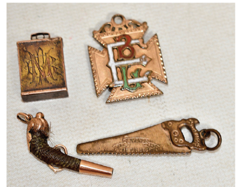
Collection of Victorian Pocket Watch Fobs, 19/20th C.