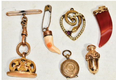
Lot (6) Art Deco/Victorian Pocket Watch Fobs, 19/20th C.