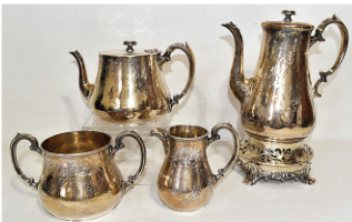
Set (4) London Sterling Silver Tea Service, Hallmarked, 18/19th C., W. 92 Oz.