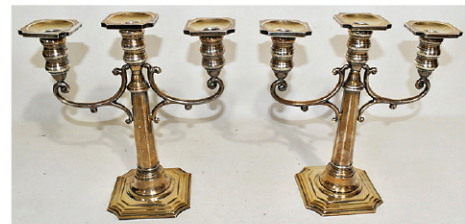
Pair Classical Sterling Silver Candelabra, 20th C, H. 10 1/4", W. 63.4 Oz.