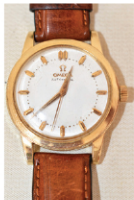
Fine Modern Omega 14kt Yellow Gold Wristwatch w/Alligator Band, C. 1960