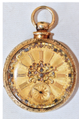
Exceptional 18kt Yellow Gold Fancy Face Pocket Watch, Early 19th C., Diam. 51.95mm