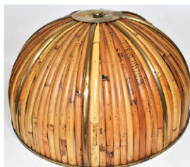
Rare Gabriella Crespi Italian (Rising Sun Series) Bamboo Floor Lamp Shade, C. 1973 Italy, H. 12", D. 24"