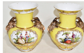
Pair K.P.M. H/P Figural Ram's Head Vases, 19th C., H. 6 3/4"