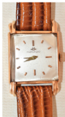
Vintage Movado 18kt Rose Gold Tank Wristwatch, C. 1940