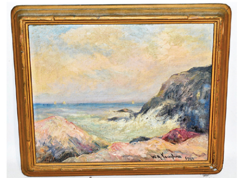
O/P Seascape Signed W.R. Vaughan, C. 1940, Sight 8" X 10"