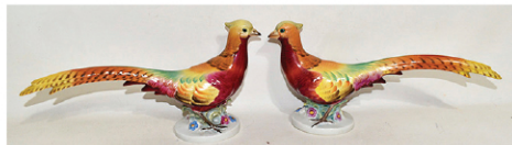
Herend-Hungry Porcelain Golden Pheasants, 19/20th C., H. 6 1/2", L. 13"