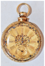
Exceptional 18kt Yellow Gold Fancy Face Pocket Watch, Early 19th C., Diam. 51.95mm