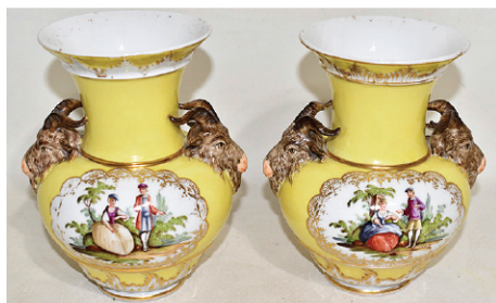
Pair K.P.M. H/P Figural Ram's Head Vases, 19th C., H. 6 3/4"