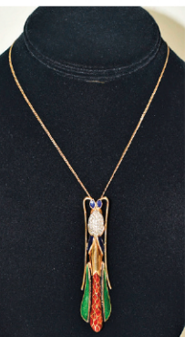
Rare Egyptian Revival 14kt Yellow Gold/Diamond/ Enameled Praying Mantis Pendant & Chain Approximately 1 Ct. Round Bright White Diamonds, C. 1920/30, W. 10.6 DWT