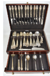
Gorham Sovereign Pattern Flatware Service for 12 w/ 7 Pc. Place Setting/ Serving Pcs., C. 1950/60, W. 112.0 Oz.