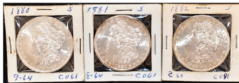
Lot (3) Morgan Silver Dollars - 1880-S, 1881-S, 1882-S, Unc