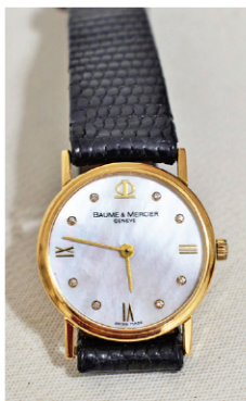
Baum-Mercier 18kt Yellow Gold/Diamond Wristwatch with Mother of Pearl Dial, C. 1960/70