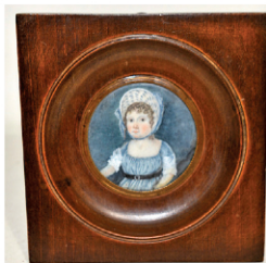
Rare Folk Art W/C Portrait of a Child w/Blue Bonnet, 19th C., D. 2"