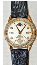
Rare Kingston Watch Co., Moon Phase, Day, Date & Month "Datofix" Wristwatch, C. 1950/59, Dia. 33.21mm