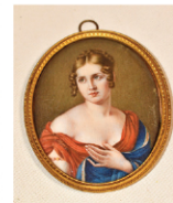
W/C Portrait Miniature Signed Cordelli, 19th C., H. 3 1/2", W. 2 3/4"