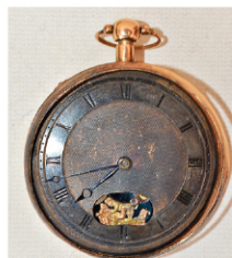
Fine Rare Brequet A Paris 18kt Yellow Gold/Silver Dial Erotica Automaton Pocket Watch w/ Fuesse Movement, 18th C.