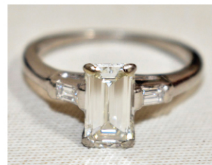
Exceptional Platinum Diamond Engagement Ring with 1.05 CT Emerald Cut Center Stone With .20 Ct Baguettes, C. 1920/30, Weight 3.0 DWT, Size 7