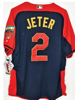
Yankees American League All Star Jersey Signed by Derek Jeter w/ COA