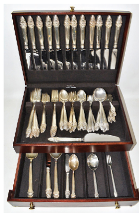
Gorham Sovereign Pattern Flatware Service for 12 w/ 7 Pc. Place Setting/ Serving Pcs., C. 1950/60, W. 112.0 Oz.