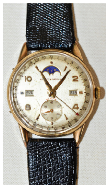
Rare Kingston Watch Co., Moon Phase, Day, Date & Month "Datofix" Wristwatch, C. 1950/59, Dia. 33.21 mm

www.AuctionZip.com ~ Auctioneer ID# 11093