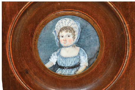
Rare Folk Art W/C Portrait of a Child w/Blue Bonnet, 19th C., D. 2"