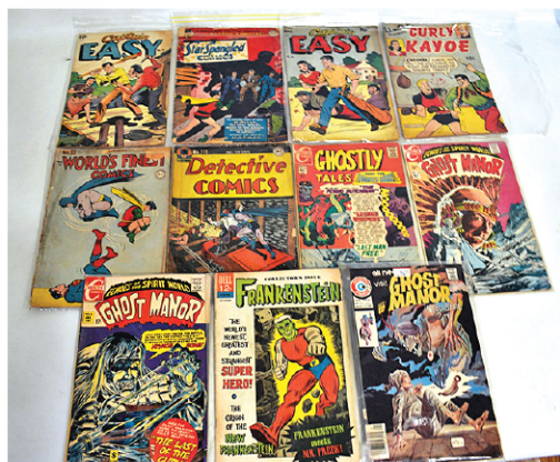
Lot (11) Estate Action Comics (Golden Years)