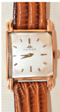
Vintage Movado 18kt Rose Gold Tank Wristwatch, C. 1940