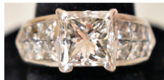
Fine Art Deco Platinum/Diamond Ring w/2.75 Ct. Princess/Ascher Cut Center Stone w/1.40 Ct. Princess Cut Side Diamonds, C. 1940, W. 6.0 Dwt, Size 6

www.AuctionZip.com ~ Auctioneer ID# 11093