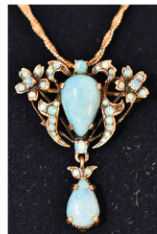
Exceptional Art Nouveau Fire Opal Necklace/ Brooch, C. 1910, W. 3.7 Dwt, H. 1 1/2", W. 1 1/4"