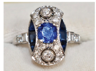
Art Deco Platinum Blue Sapphire/Diamond Evening Ring with 1.15 Ct Natural Pailin Sapphire Center Stone with 0.75 Ct Side Stones & 0.75 Ct Diamonds, C. 1920, Weight 4.7 DWT, Size 9