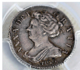
1703 Great Britain Silver 6D Pence, Virgo Struck from Silver Seized at Virgo Bay, Spain, XF45