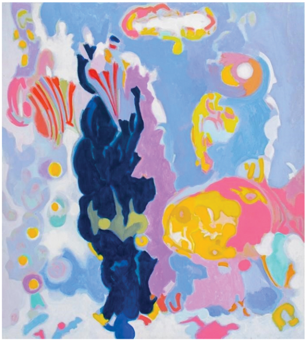
Lawrence Glickman Abstraction in Blue Acrylic