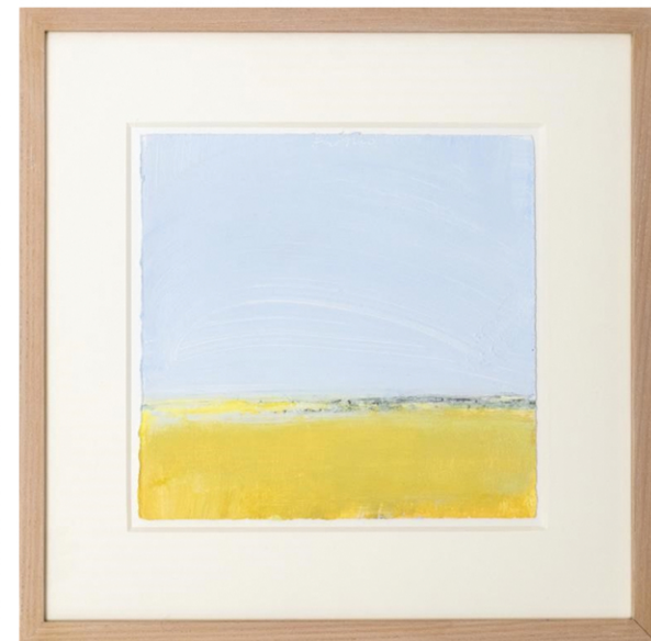
Eric Aho 'County Mayo #30' Modern Acrylic on Paper