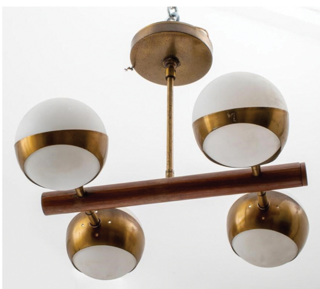
Italian Stilnovo Chandelier With Opaline Spheres