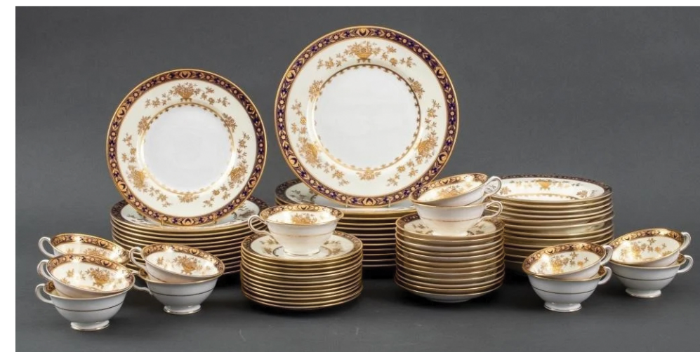
Minton, Tiffany & Co "Dynasty Cobalt" Service, 12