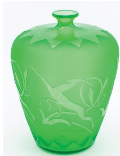
Art Deco Steuben Acid- Etched Green Glass Vase