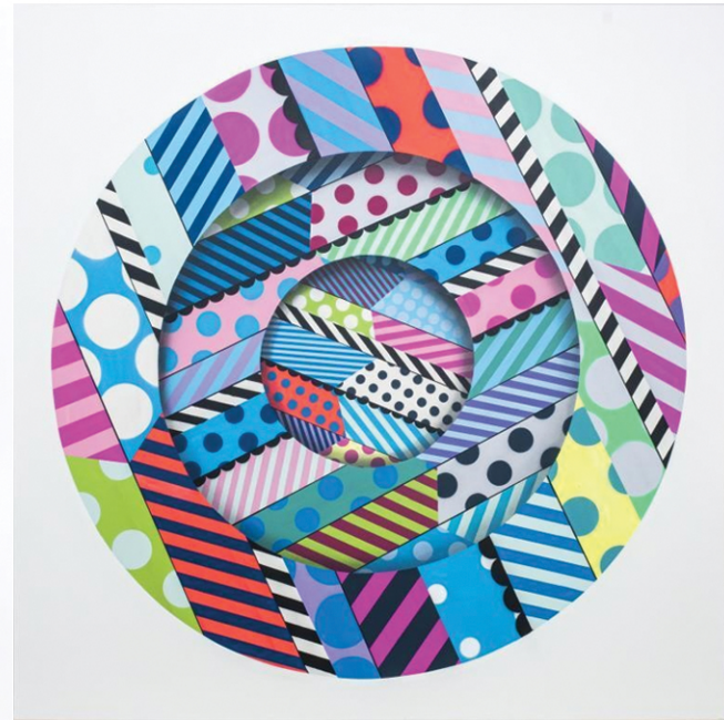
Jason Woodside Large Acrylic & Aerosol on Canvas