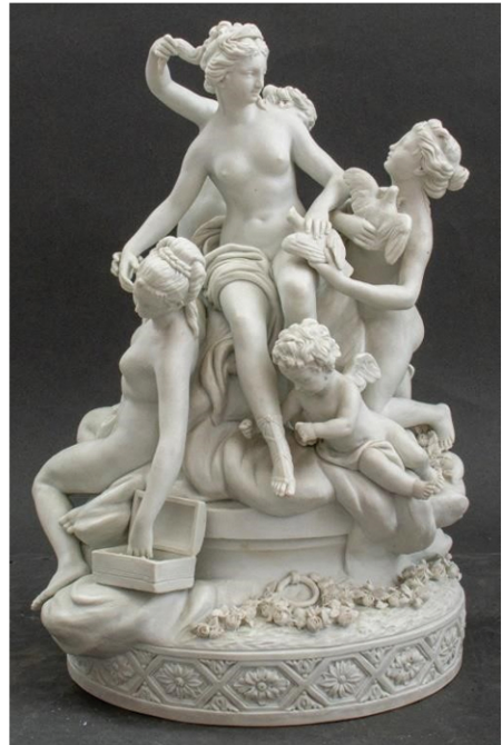
Sevres Bisque "Toilet of Venus" after Boizot