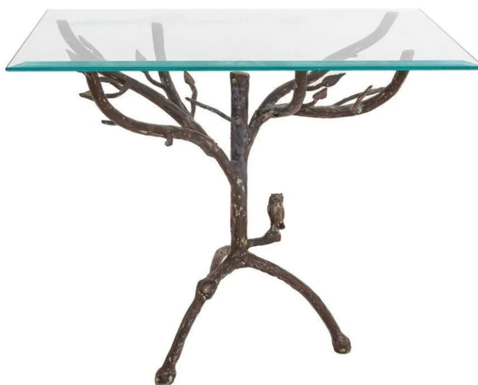
After Giacometti, Ralph Pucci Owl Side Table 1990s