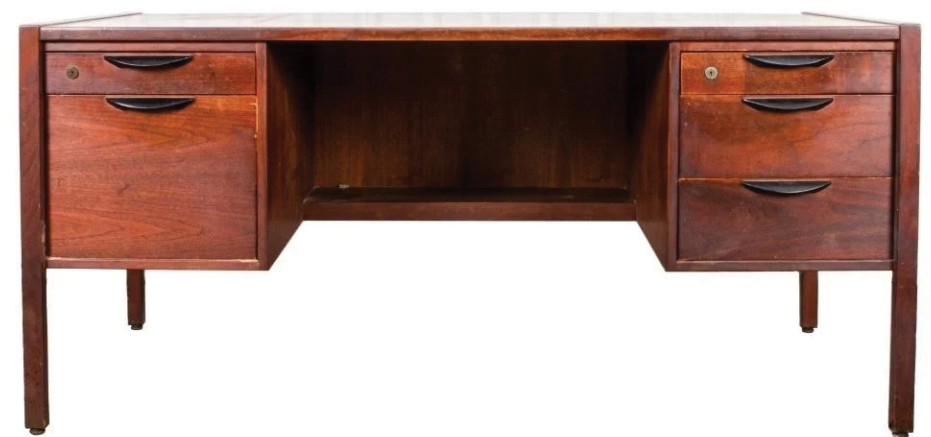
Jens Risom Mid-Century Modern Teak Desk

OUR NEW PREVIEW SPACE IS OPEN 10am - 6pm Wednesday to Sunday