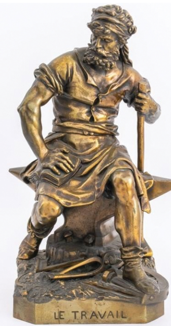
Charles-Auguste Lebourg, "Le Travail" Bronze 1906