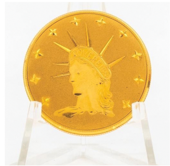
Benrus 18K Yellow Gold Coin Case Pocket Watch