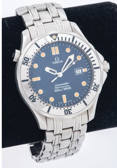
Omega Seamaster Professional Diver Watch