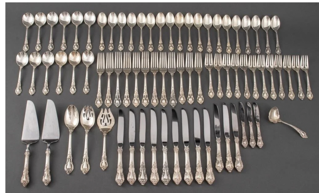
Lunt Sterling "Eloquence" Pattern Part Service