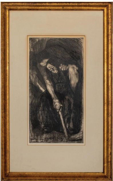
Kathe Kollwitz "Inspiration" Etching on Paper