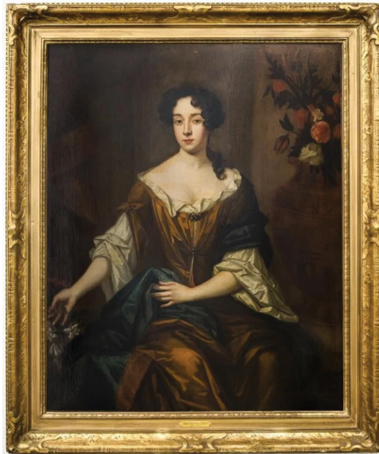
Sir Peter Lely Attributed Portrait of a Noblewoman