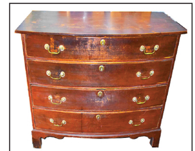
NH Bow Front in Old Surface