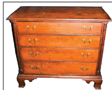
Period Furniture including this Chippendale chest in old finish