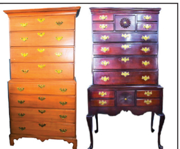
Period Case Furniture