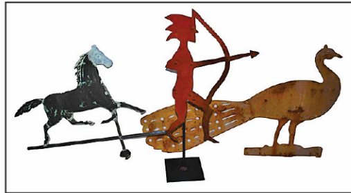
Selection of Weather vanes