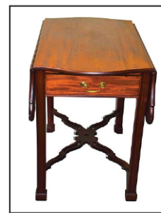
MA Pembroke Table, 1 of Several Tables