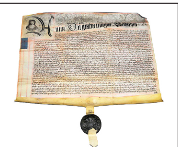
Historical items including Benning Wentworth appointment as Governor