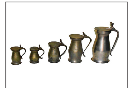
Graduated Pewter Tankard Set