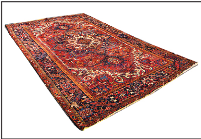
Oriental Room Size Rug