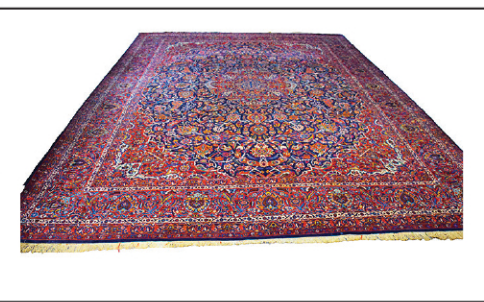
Large Selection of Antique Estate Rugs including Heriz and Others