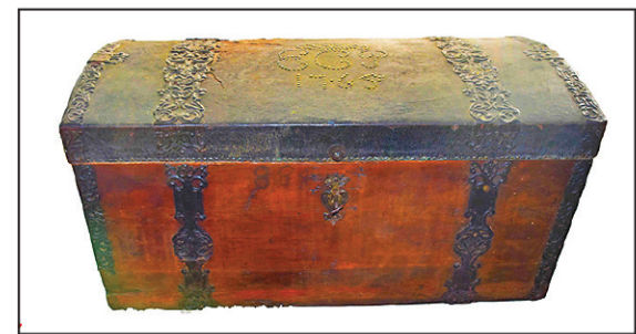
Large 1765 Storage Chest of E. Pepperell