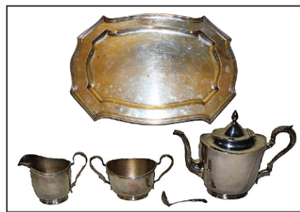
Nice Selection of Silver