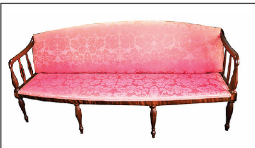
Period Sheraton Portsmouth Sofa