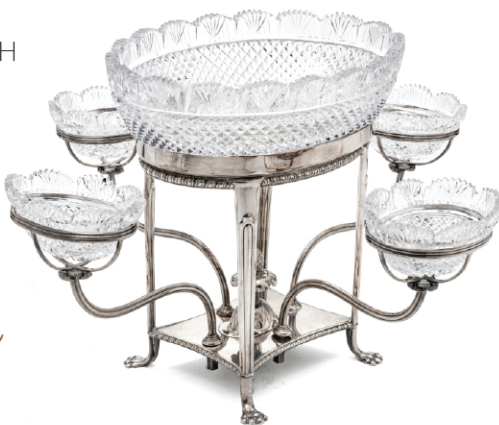
English Sheffield Plate And Hand Cut Crystal Epergne H 12" L 21" Depth 17"