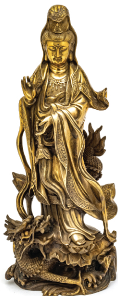
Chinese Gold Bronze Quan Yin, Dragon At Feet C. 19th.c., H 18" W 6"