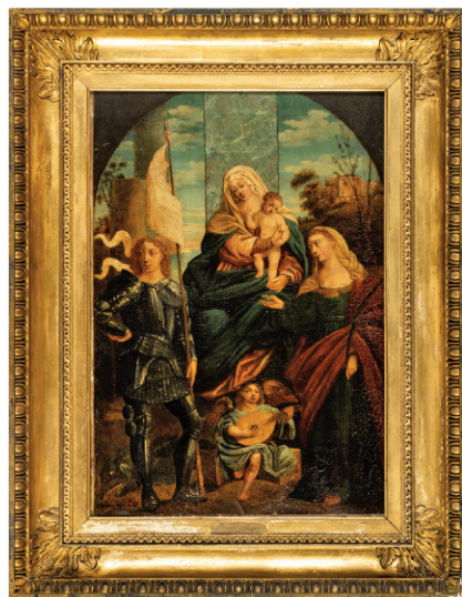
After Jacopo Palma il Vecchio (Ital- ian 1480-1528) Oil On Canvas, 19Th C., H 23", W 16", Madonna Enthroned With Saints