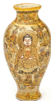
Japanese Satsuma Earthenware Pottery Collection 12 Lots This Month!