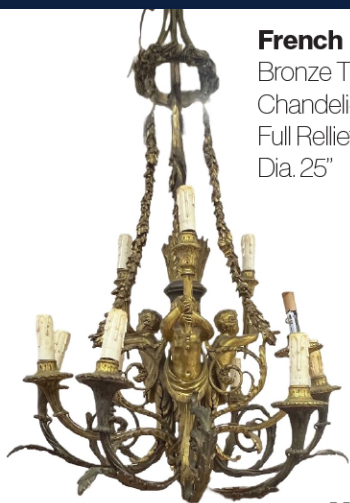
French Bronze Two Tier 12 Light Chandelier, 3 Cherubs In Full Relief C. 19th.c., H 43" Dia. 25"