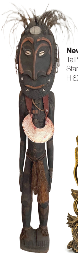
New Guinea Tall Wood Standing Figure H 62" W 11"