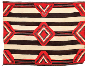
A Late Classic Style Man's Wearing Blanket Circa 1900