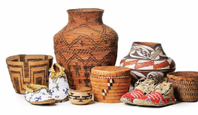
Basketry, Beadwork and Pottery