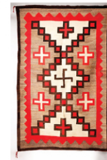
A Large Crystal Rug Style of J.B. Moore Trading Post