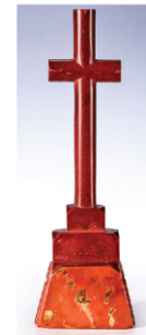
A Large and Rare Catlinite Cross on Plinth