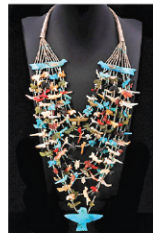
A 200-Piece Zuni Fetish Necklace