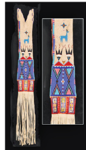
A Fine Quill and Beadwork Pipe Bag by Joyce Growing Thunder