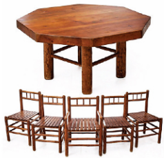
Lodge Table and Chairs, Alaska 1940s