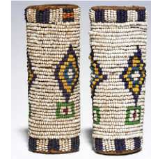
Rare 19th C. Plains Beaded Hair Tie Pairs