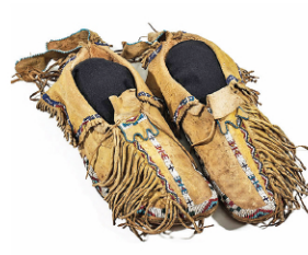
Native Tanned Moccasins and Bags with Beadwork