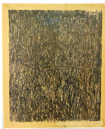
Lithograph, Jasper Johns, coathanger