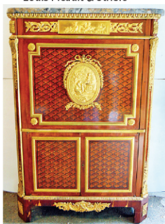
Exceptional bronze mounted marble top