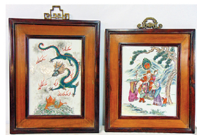
Sample of Chinese & Japanese porcelain plaques

TERMS: Cash, check, all major credit cards accepted. No Paypal • Buyer's Premium 25% on all lots • Sales tax 8.125% Tax exemption requires copy of all out-of-state vendors certificate and/or verified New York State ST-120 on file.