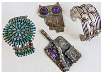
From a collection of Spratling, native American and Modernist jewelry