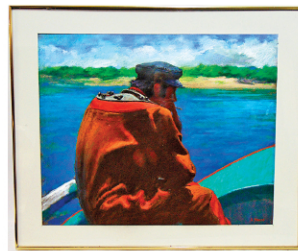
Selection of art by Americo DiFranza