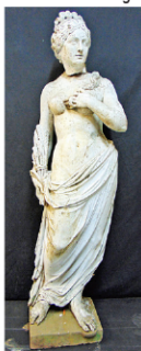
Carved limestone, 57 tall