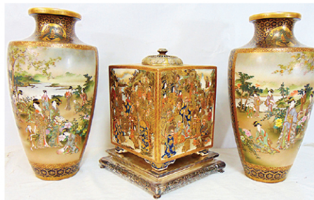
Fine quality Satsuma porcelain