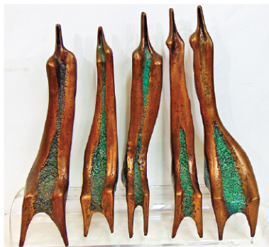
Bronze group by Aharon Bezalel