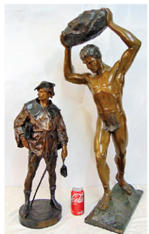
Sample Estate bronzes, Emile Louis Picault & others