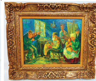
One of two oils by Chaim Goldberg, also have etchings