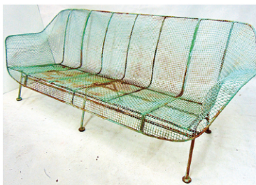
Woodard, also have table & chairs