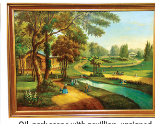
Oil, park scene with pavillion, unsigned, 19th Century