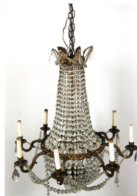
Gilt Metal 8 Light Chandelier 36"h x 30"diam.