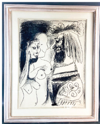
Pablo Picasso (1881 - 1973) "Le Vieux Roi (The Old King)" 1959 From the estate of Michael Lang - Co-creator of the Woodstock Music Festival