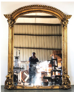
A Large 19C Giltwood & Gesso Ornamental Mirror 92"h x 72"w