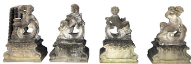
A Set of 4 Portland Cement Cherubs on Pedestals