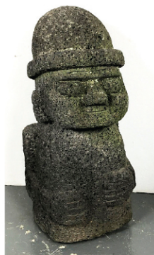
Jeju Island Dol Hareubang Lava Rock Statue 42"h x 19"w x 19"