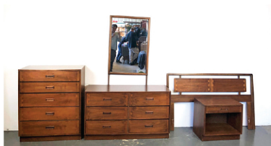
4 Piece Lane Acclaim Dovetail Bedroom Set