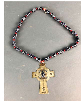
Charles Amaldi Silver Cross with Trade Beads. Hudson Bay fur trade Celtic cross with Lewis and Clark Trade Beads.