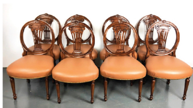
A Set of 8 Mahogany Balloon Back Dining Chairs With large leathers seats and brass nail trim.