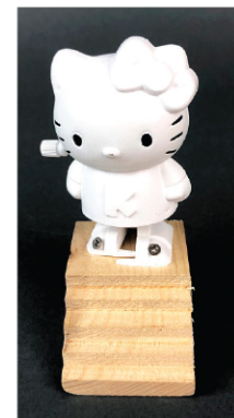
Tom Sachs American - Born 1966 Signed "Hello Kitty"