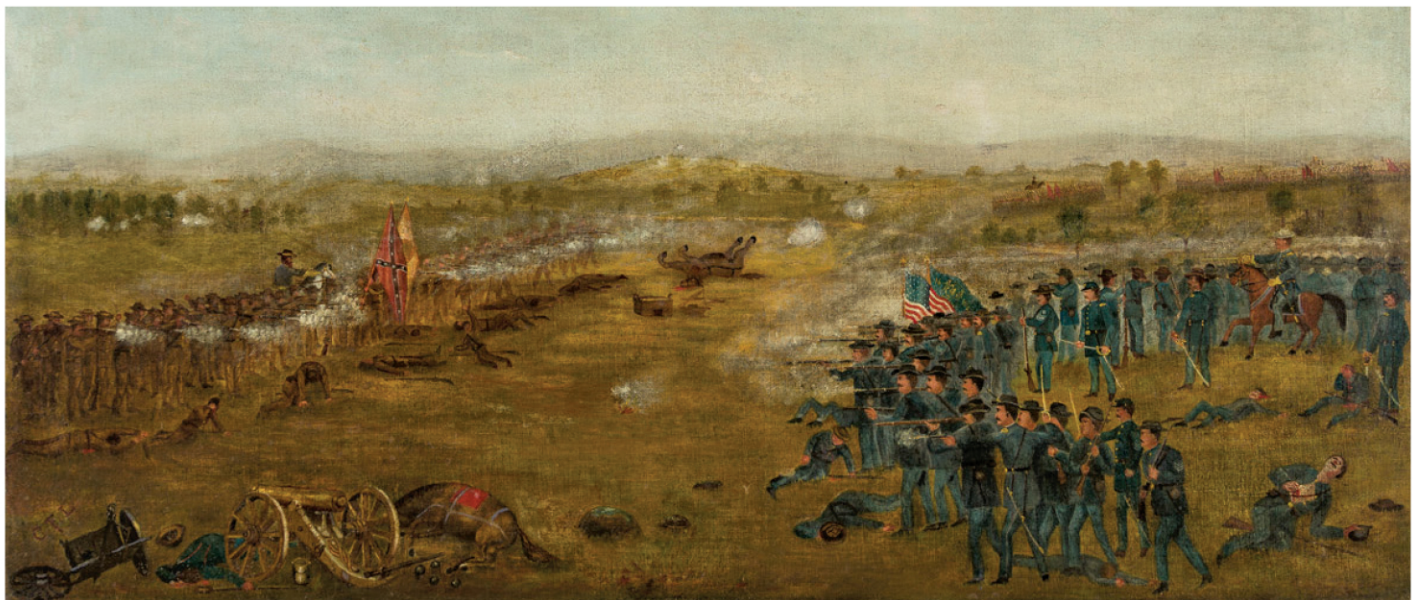
Cherbury F. Lothrop, The 16th Maine Volunteers, First Day at the Battle of Gettysburg , oil, circa 1900. Estimate $15,000 to $25,000.