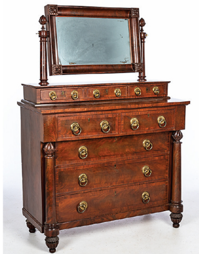
Classical Mahogany Dressing Chest, Stamped Rufus Pierce, Boston, c. 1828-29, $2,000-4,000