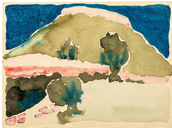
Georgia O'Keeffe (NM/NY, 1887-1986), Untitled (Canyon, Texas Landscape), Watercolor, 1917, listed as item 196 in the catalogue raisonne, $100,000-150,000