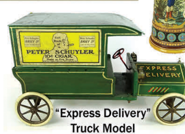
"Express Delivery" Truck Model