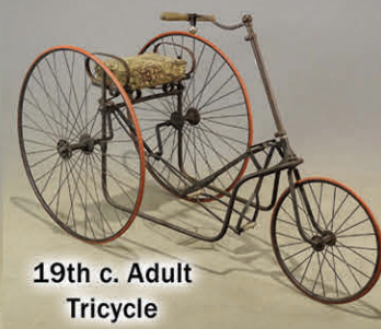
19th c. Adult Tricycle