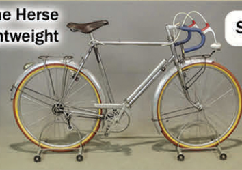
Rene Herse Lightweight