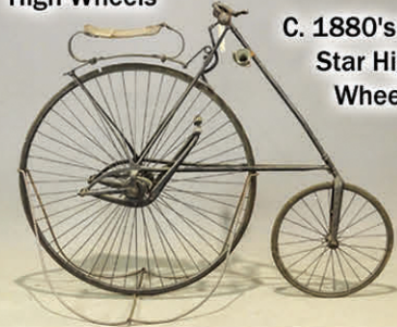
C. 1880's Pony Star High Wheel