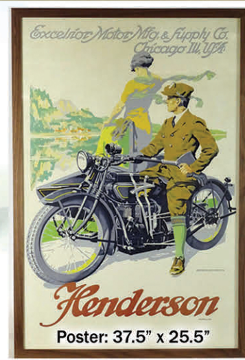
Poster: 37.5" x 25.5"