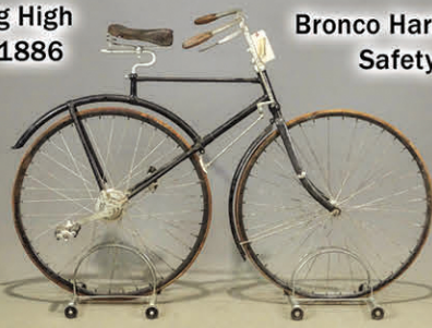
Bronco Hard Tire Safety