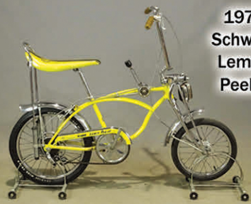
1970 Schwinn Lemon Peeler