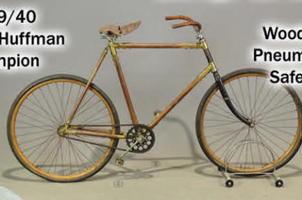
Wooden Pneumatic Safety