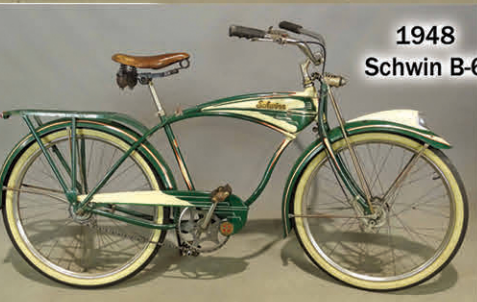
1948 Schwinn B-6