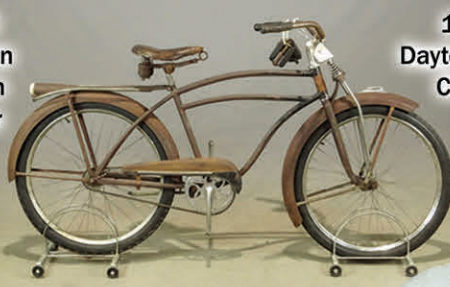
1939/40 Dayton/Huffman Champion