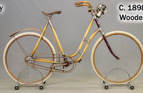
C. 1898 Chillion Wooden Bicycle