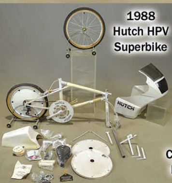
1988 Hutch HPV Superbike