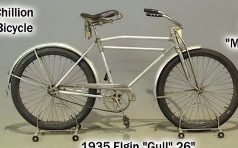
1935 Elgin "Gull" 26"