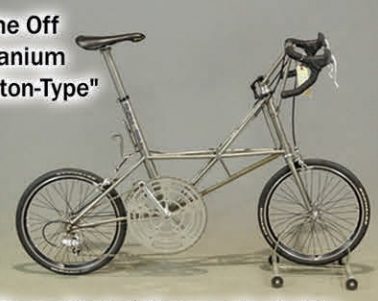
One Off Titanium "Moulton-Type"