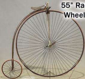
55" Racing High Wheel c. 1886

900 LOTS Including Bicycles and Bicycle & Automobilia related items.