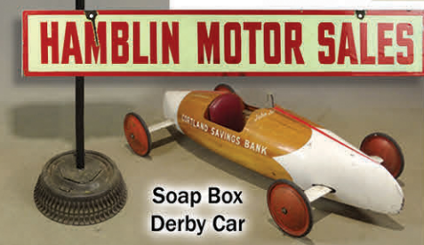
Soap Box Derby Car