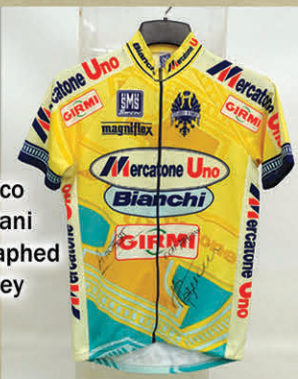
Marco Pantani Autographed Jersey