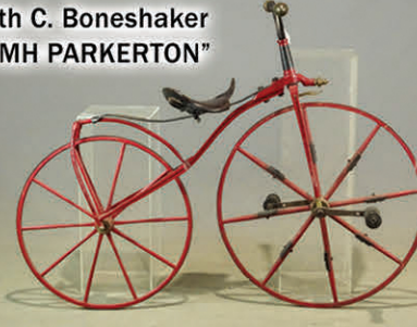
19th C. Boneshaker "WMH PARKERTON"