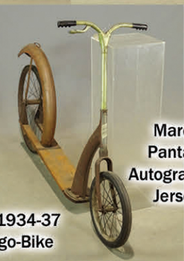
C. 1934-37 Ingo-Bike