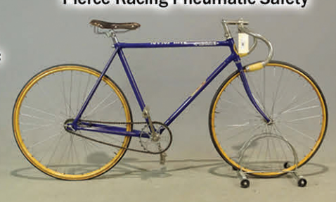
Pierce Racing Pneumatic Safety