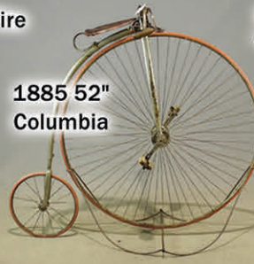
1885 52" Columbia