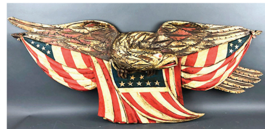
A Carved Wooden Painted Eagle and Flag 24" h x 60" w x 7" d