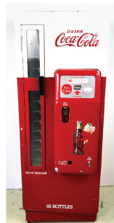
10 Cent Coca Cola Machine Manufactured by Vendo 56 1/2" h x 25 1/4" w x 20 1/2" d