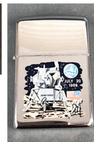
Nasa Apollo 11 Mission Zippo Lighter Original Box Lighter is 2 1/4" x 1 1/2"