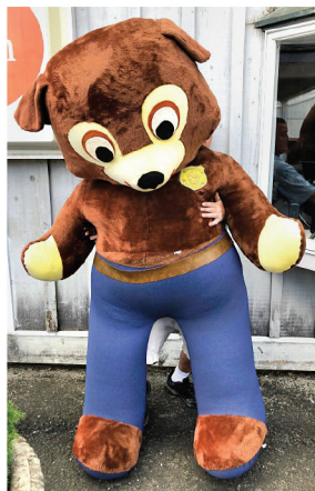
Life Size Smokey the Bear Stuffed Animal Manufactured by Knickerbocker. Owner purchased the bear in 1974 at Macy's in NYC 81" h x 49" w x 22" d