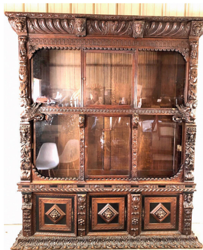
Flemish Highly Carved Bookcase Comes in 3 pieces for easy movement. 97 1/2" h x 82" w x 22" d