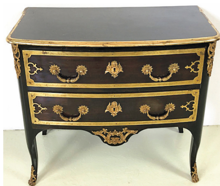
Louis XV Style Black Lacquered 2 Drawer Commode With bronze mounts. From the Estate of Burt Wayne, Interior Designer, NYC. 32 3/4" h x 38" w x 21 1/4" d