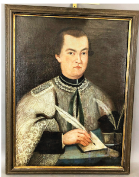
18th C Painting of Nobleman Sight is 19 1/4" x 25 3/4"