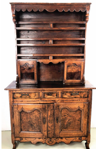
19 Century French Provincial Oak Buffet 86" h x 51" w x 19 1/2" d