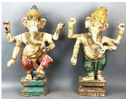
2 Lord Ganesha Wooden Statues Tallest is 28" x 17 1/2" w x 8" d