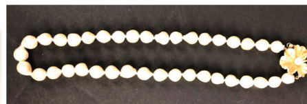
Semi Baroque Pearl Necklace with 14K Gold Clasp 8 1/2" l when clasped.