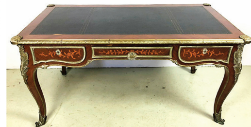
Louis XV Style Inlaid & Bronze Mount Bureau Plat 30" h x 60 1/2" w x 31" d