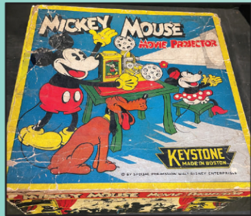
Antique Toys, Cast Iron Toys, Trains