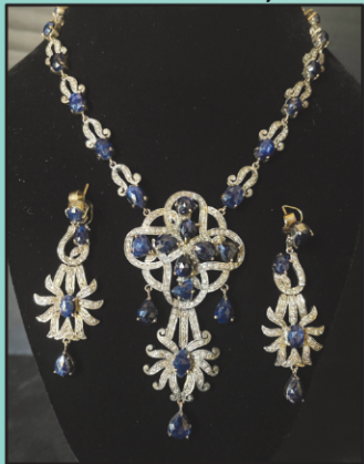
Large Collection of Quality Jewelry & Costume Jewelry

Selling Over 1800 Lots at No Reserve of Jewelry, Artwork, Sterling, Coins, Watches, Lamps, Furniture, Oriental Rugs, Porcelain, Pottery, Stamps, Decoys, Vintage Clothing & Hats, Large Group of Quality Linens, Postcard Collection, Musical Instruments, Breweriana, Baseball Memorabilia & Sports Cards, Antique Toys, Trains, Native American Items, Steinway & Chickering Pianos, Victorian Leaded Glass Window, Items from the Strong Museum & Genesee Country Museum, and Much More!