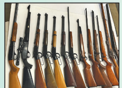
Collection of Guns including WWII Japanese Nambu, Mauser HSC