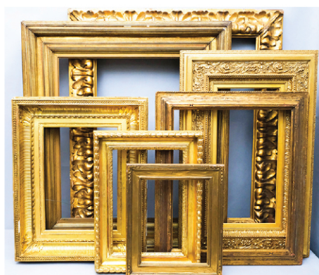
Over 75 Period Frames and Mirrors