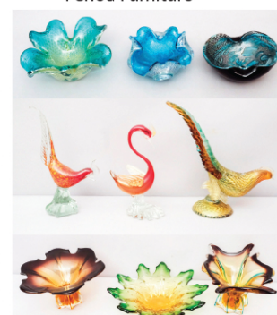
Large Collection of Murano Glass

ALL TO BE SOLD WITH NO RESERVE • We are open for in-person bidding!