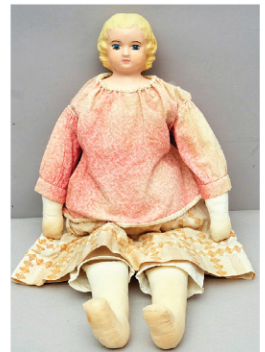
Dolls and Doll Furniture