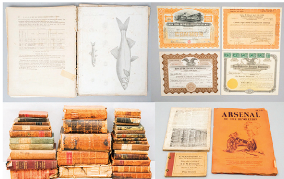
Huge Single Owner Collection of Books and Ephemera

The salvation of summer is at hand! Friends, let it be heard through heat and haze, Old Kinderhook Auction Company proudly presents a two-day marathon of offerings scantily seen.