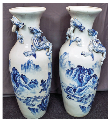
Chinese Palace Vases