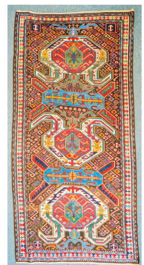
Estate Collection of Fine Antique Rugs