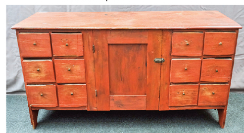
Apothecary Cabinet in Red Paint

DAY TWO begins with exquisite rugs, and then an expansive foray into Asian art and antiques, till the journey heads back west into the glass city of Venice for Murano madness. Many fine home furnishings will round it out, from furniture indoor and out to dining wares. And lest ye fear, the fires of Sol have nary lit upon all the strange and surprising that will be OKAC's August auction event.