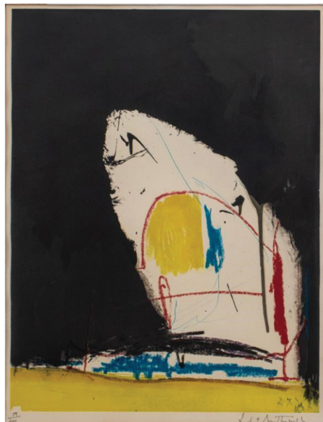
Robert Motherwell "Capriccio" Screenprint, 1961