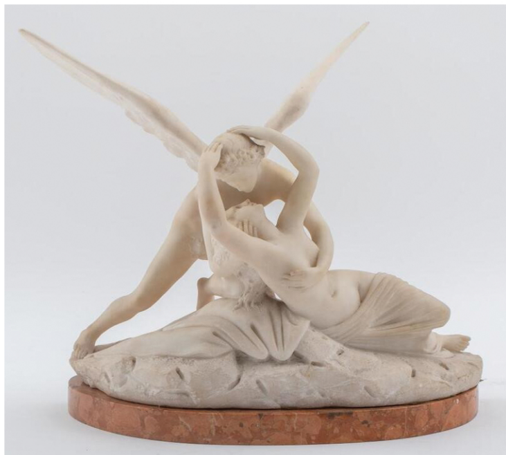
Grand Tour Marble Cupid & Psyche After Canova