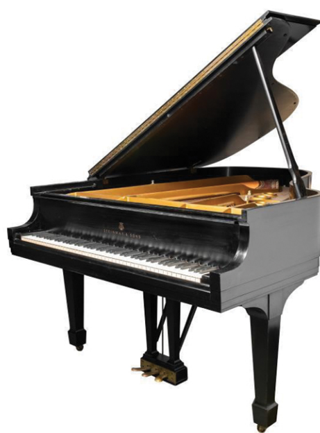
Steinway & Sons Ebony Grand Piano Model L