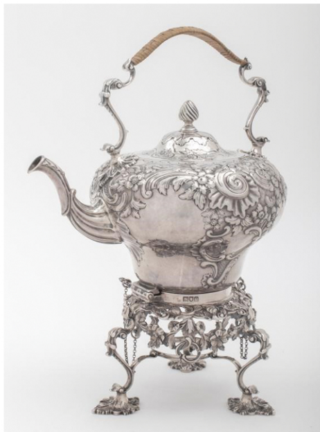
Victorian Sterling Silver Kettle on Stand