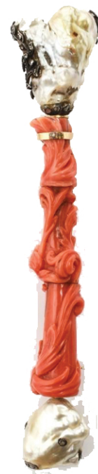
14K Gold Diamonds Coral & Baroque Pearls Brooch