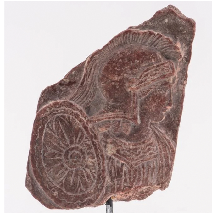
Ancient Roman Marble Fragment of Warrior