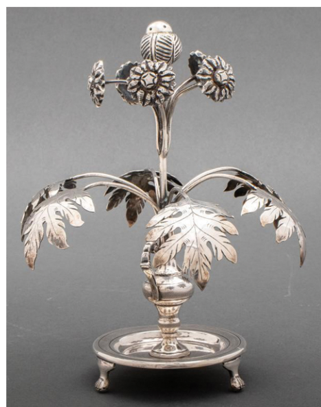
European Silver Floriform Toothpick Holder