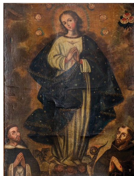
Cuzco School Spanish Colonial Oil on Canvas 18th C