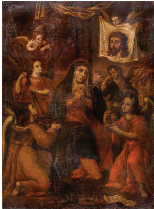
The Suffering of the Virgin, likely 18/19th C.