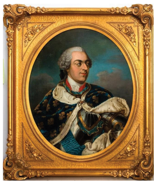
Portrait of Louis XV, Manner of de la Tour, 19 C.