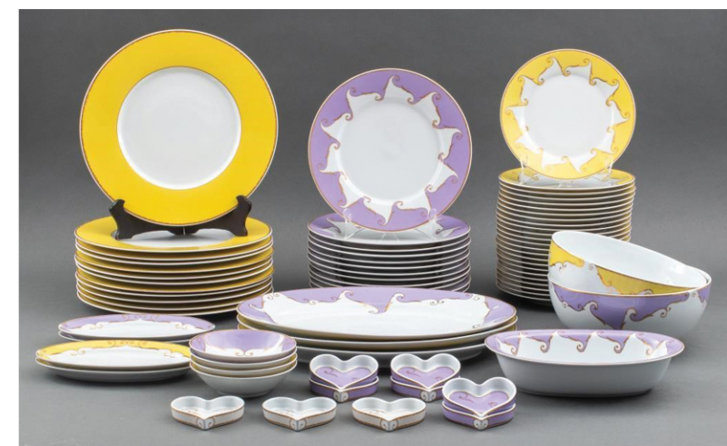
Christian Lacroix Porcelain Part Dinner Service

OUR NEW PREVIEW SPACE IS OPEN 10am - 6pm Wednesday to Sunday LIVE STREAMING ONLINE - ABSENTEE & PHONE BIDS ACCEPTED