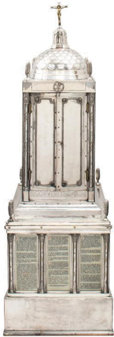
Monumental Silvered Holy Tabernacle