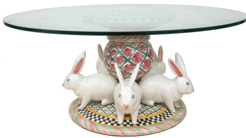
MacKenzie-Childs Glazed Ceramic "Rabbits" Table