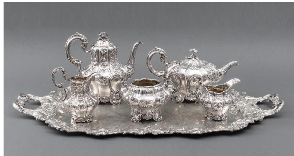
Early Victorian Sterling 5 Piece Tea Service