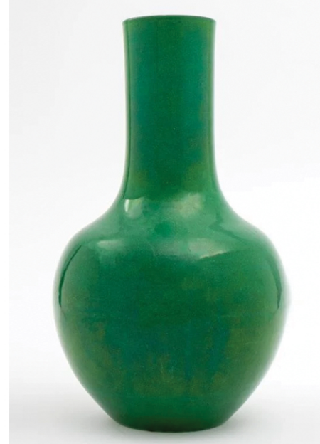
Chinese Langyao Green Glazed Bottle Vase