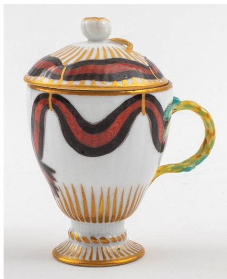
Russian Order of St. Vladimir Ice Cup, Gardner