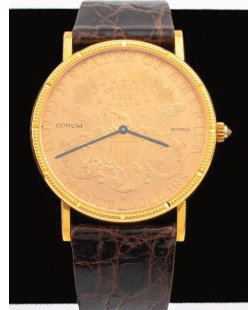
Patek Philippe 18K Gold Square Dual Dial Watch