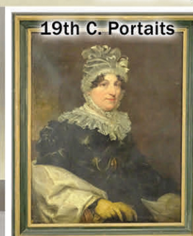
19th C. Portraits