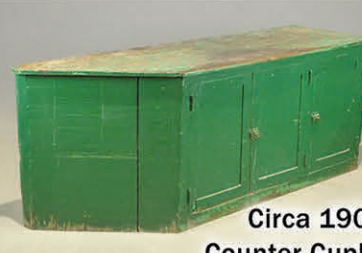
Circa 1900 Counter Cupboard