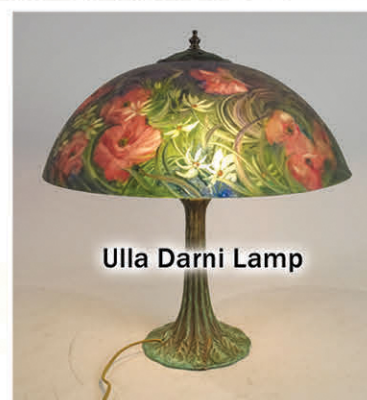
Ulla Darni Lamp