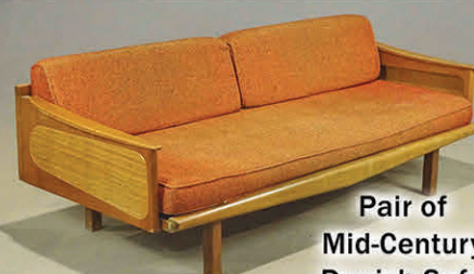
Pair of Mid-Century Danish Sofa