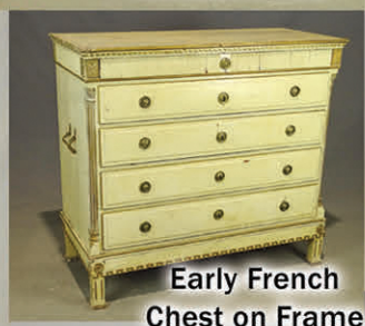
Early French Chest on Frame