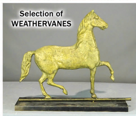
Selection of WEATHERVANES