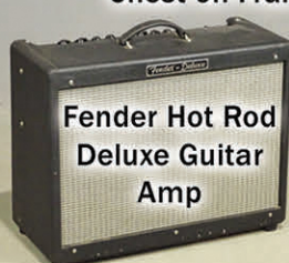
Fender Hot Rod Deluxe Guitar Amp