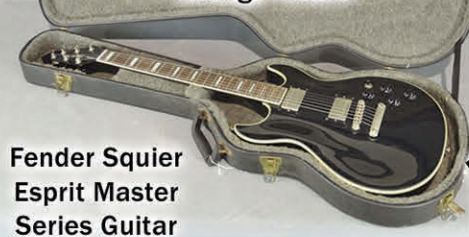
Fender Squier Esprit Master Series Guitar