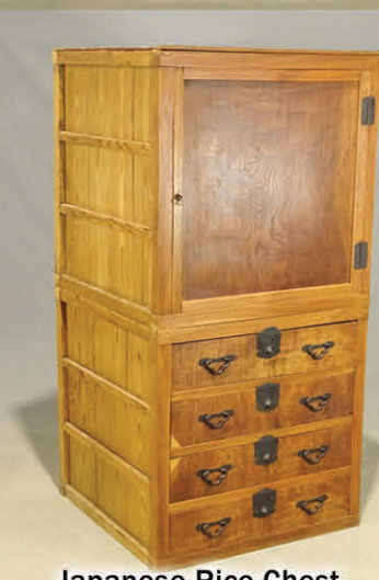
Japanese Rice Chest