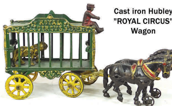
Cast iron Hubley "ROYAL CIRCUS" Wagon