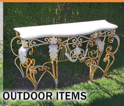
SELECTION OF OUTDOOR ITEMS