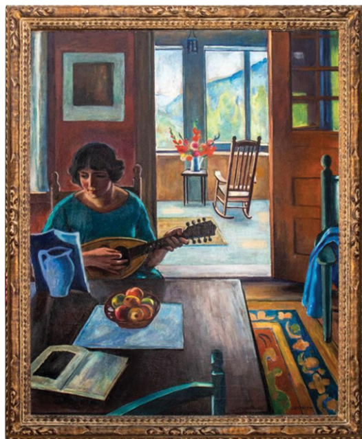
Samuel Halpert "Interior with Lute Player" Oil