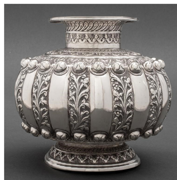
Persian Sterling Vase with Foliate Decoration