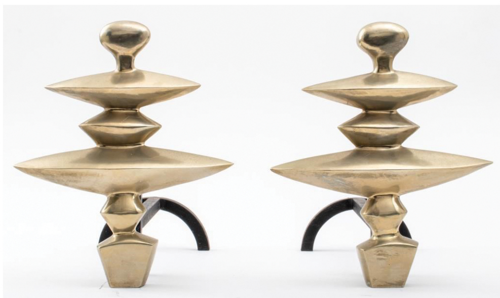
After Alberto Giacometti Bronze Andirons, Pair