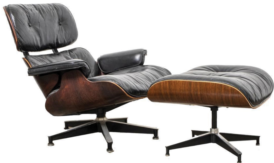
Eames for Herman Miller Lounge Chair & Ottoman