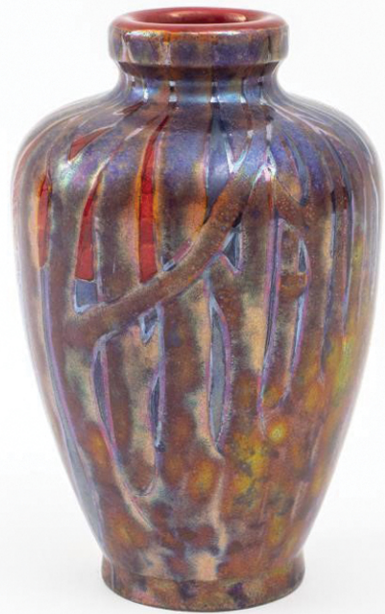
Zsolnay Ceramic Vase with Landscape