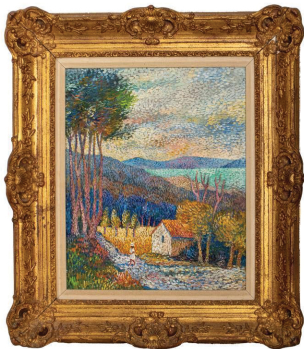
Lucien Neuquelman French Pointillist Landscape Oil