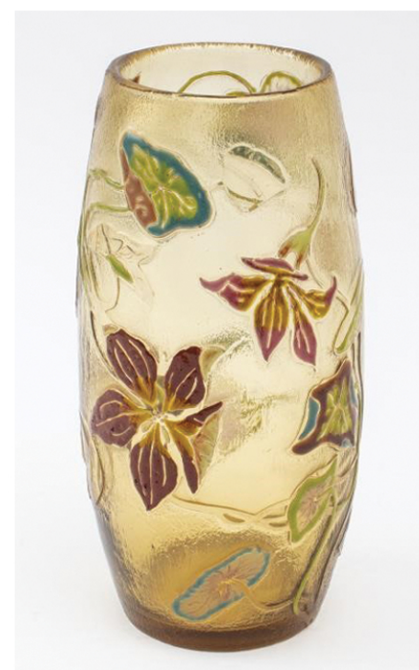
Galle Glass Vase with Gold Foil