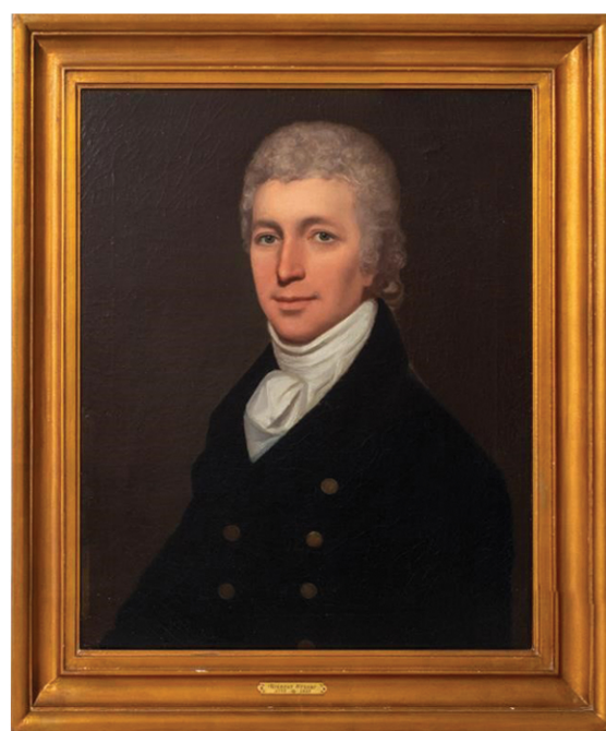
Gilbert Stuart Attributed "Portrait of a Gentleman" Oil