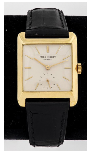
Patek Philippe 18K Gold Square Dual Dial Watch