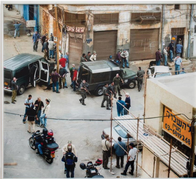
Barry Frydlander "The Raid" Photograph