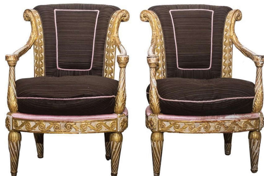
Northern Italian Giltwood Armchairs, 17th / 18th c

OUR NEW PREVIEW SPACE IS OPEN 10am - 6pm Wednesday to Sunday