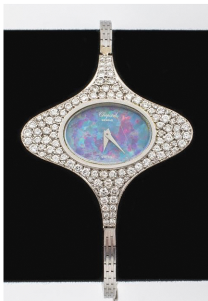
Chopard 18K White Gold Diamond Opal Lady's Watch