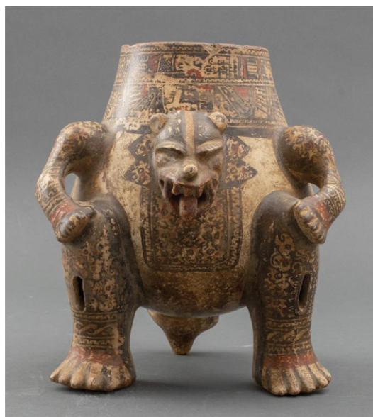
Pre-Columbian Ceramic Jaguar Effigy Vessel