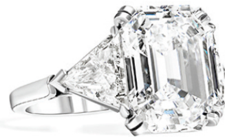
Lot 30 - GIA certified 10.05 ct E VVS2