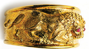
Lot 19 - David Webb Cuff

Pre-registered bidders can bid live in person, online (bidsquare, liveauctioneers) via phone or by left bid.