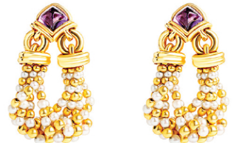
Lot 5 - Bvlgari Earrings