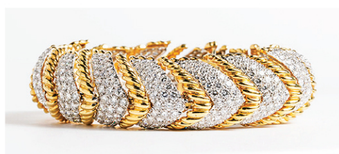
Lot 47 - David Webb Bracelet