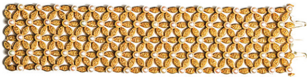
Lot 29 - Buccellati Bracelet