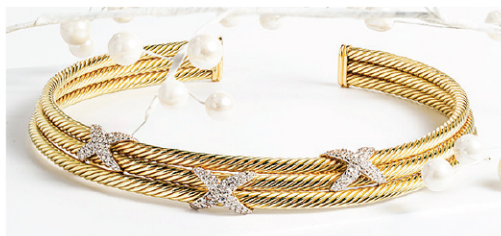
Lot 39 - David Yurman Collar