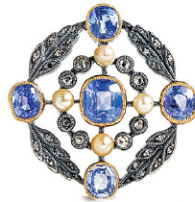
Lot 121 - Unheated Kashmir Sapphire Victorian Pendant