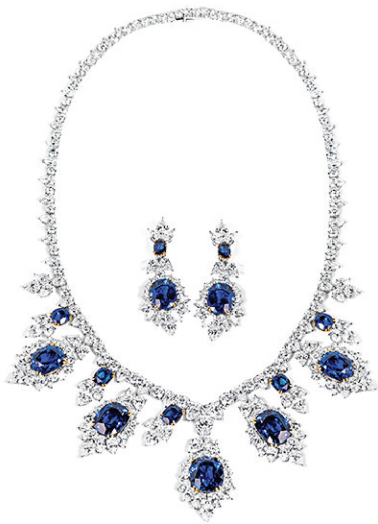
Lot 70 - AGL Certified Unheated Sapphire and diamond set

Preview begins in person May 19th, 20th, 21st, 23rd and 24th | 10am to 4pm