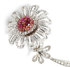
Lot 66 - Hemmerle Ruby Diamond Brooch