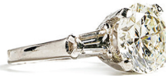
Lot 32 - 3.58 GIA Certified Diamond Ring