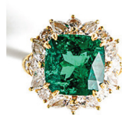
Lot 73 - 8.39 AGL Certified Colombian Emerald Ring