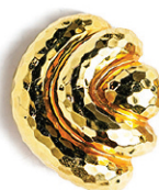
Lot 1 - Henry Dunay Earrings