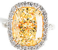
Lot 81 - 11.79 GIA certified Fancy Yellow Diamond Ring