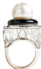
Lot 63 - David Webb Ring