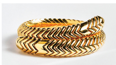
Lot 28 - Bvlgari Serpentine Bracelet