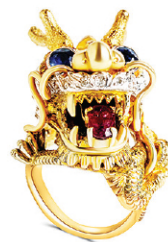
Lot 115 - 14k Yellow Gold Dragon Ring