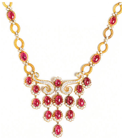
Lot 38 - Ruby and Diamond Necklace