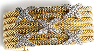
Lot 40 - David Yurman Cuff