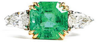
Lot 72 - GIA Certified Colombian Emerald