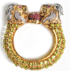
Lot 4 - Andrew Gates Lion Bracelet