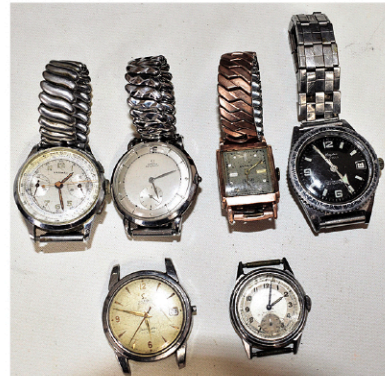
LOT (6) VINTAGE ESTATE WATCHES INCL. OMEGA SEAMASTER, OMEGA AUTOMATIC, HARMON CHRONOGRAPH, MOVADO, ATOMIC 14KT ROSE GOLD & KINGSTON 25; C. 1950/60