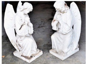
PR. ITALIAN CARRERA MARBLE GUARDIAN ANGELS, 19/20TH C., H. 40"