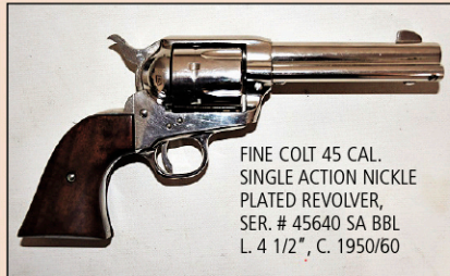
FINE COLT 45 CAL. SINGLE ACTION NICKEL PLATED REVOLVER, SER. # 45640 SA BBL L. 4 1/2", C. 1950/60