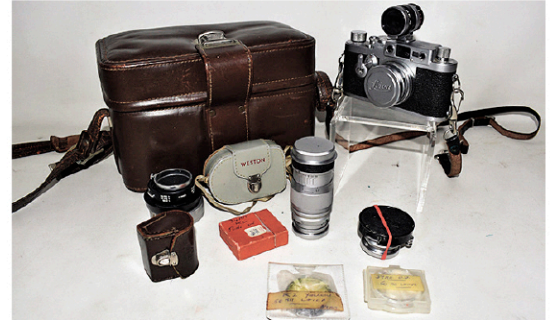
LEICA 111G CAMERA W/ EXTRA LENSES INCL. EDNALITE TELEPHOTO F-9 CM 1:4, SUMMICRON F-5 CM, SUMMARON F-3.5 CM W/FITTED LEATHER CASE AND ASSORTED FILTERS