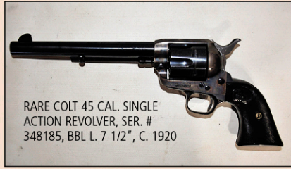
RARE COLT 45 CAL. SINGLE ACTION REVOLVER, SER. # 348185, BBL L. 7 1/2", C. 1920

SESSION 1 MILITARIA & GUNS WILL BEGIN AT 11AM WITH A NICE SELECTION OF FIREARMS INCL. WINCHESTER TARGET RIFLES, COLT SA REVOLVERS & EPHEMERA