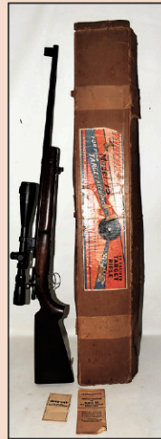
RARE WINCHESTER MODEL 75 BOLT ACTION RIFLE W/BSA 20-150 X SCOPE, C. 1940, SER. # 7591 WITH ORIGINAL BOX, BROCHURE & PAPERS