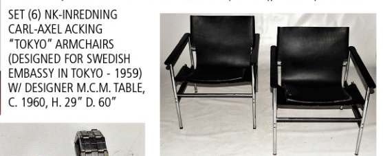
SET (6) NK-INREDNING CARL-AXEL ACKING "TOKYO" ARMCHAIRS (DESIGNED FOR SWEDISH EMBASSY IN TOKYO - 1959) W/ DESIGNER M.C.M. TABLE, C. 1960, H. 29" D. 60"