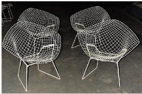
LOT (4) BERTOIA DIAMOND CHAIRS, 20TH C.