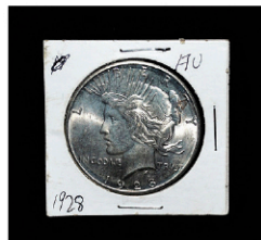
1928-P PEACE SILVER DOLLAR AU