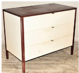
FLORENCE KNOLL THREE DRAWER TEAK/LAMINATED DRESSER, 20TH C., H. 29", W. 36", D. 19 1/2"