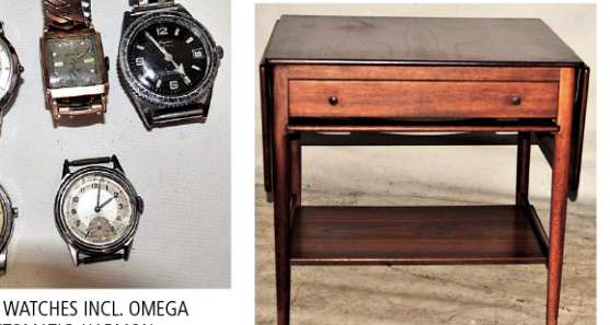
HANS WEGNER TEAK DROP LEAF SEWING TABLE, 20TH C., H. 23 1/2", W. 25", D. 23"

Location: 195 Derby Road, Middletown, NY 10940