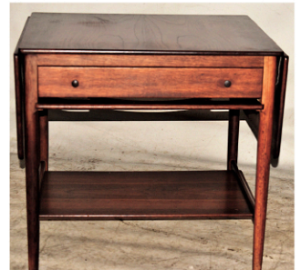
HANS WEGNER TEAK DROP LEAF SEWING TABLE, 20TH C., H. 23 1/2", W. 25", D. 23"