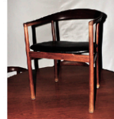
SET (6) NK-INREDNING CARL-AXEL ACKING "TOKYO" ARMCHAIRS (DESIGNED FOR SWEDISH EMBASSY IN TOKYO - 1959) W/ DESIGNER M.C.M. TABLE, C. 1960, H. 29" D. 60"