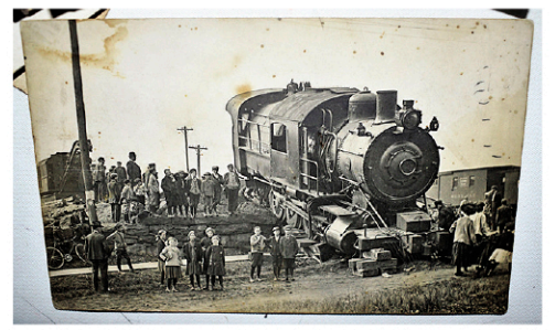
LARGE COLLECTION OF POSTCARDS - 12,000+