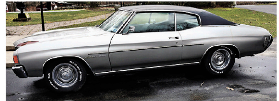
1972 CHEVROLET CHEVELLE MALIBU, VIN# 1D37H2B639163, MILEAGE 94, 132