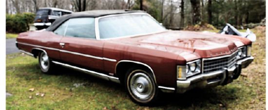
1971 CHEVROLET IMPALA CONVERTIBLE, VIN. # 1646714140586, MILEAGE 1 - 33224