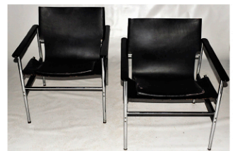
POLLOCK FOR KNOLL LEATHER ARMCHAIRS, 20TH C.