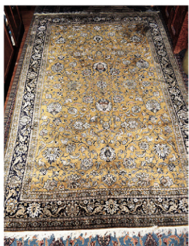
SEMI-ANTIQUE EXCEPTIONAL PERSIAN ISFAHAN CARPET, 20TH C., 6' X 10' 2"