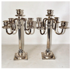
PAIR CLASSICAL SILVER 800 (5) LIGHT CANDELABRA SIGNED WITH HALLMARKS, 20TH C., H. 18"