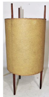
RARE ISAMU NOGUCHI CHERRY/FIBER TABLE LAMP, C. 1940/50, H. 16"