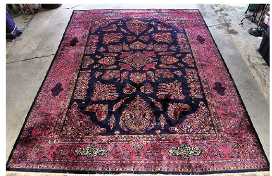
FINE ANTIQUE DEEP BLUE GROUND SAROUK (SIGNED), 19TH C., 8 1/2' X 11'