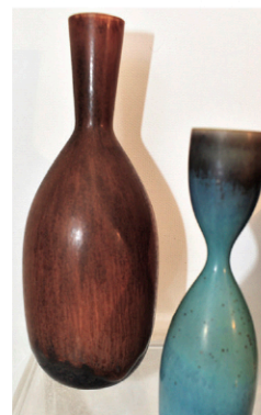
LOT (13) ASSORTED DANISH MODERN VASES/BOXES, 20TH C., SIGNED RORSTRAND, H. 6"