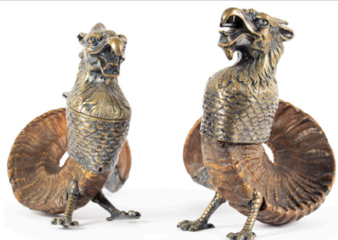
AUSTIN & CO. (DUBLIN) RAM'S HORN CANDLESTICKS, 19TH C PAIR, H 7.5", L 12.75"