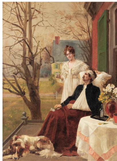
EDOUARD JEAN BAPTISTE DETAILLE (FRENCH, 1848-1912) OIL ON CANVAS, H 24" W 18" WOUNDED FRENCH SOLDIER