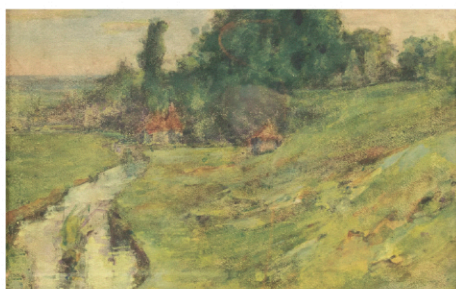
LÉON AUGUSTIN L'HERMITTE (FRENCH, 1844-1925) WATERCOLOR ON HEAVYWEIGHT WOVE PAPER, 1877