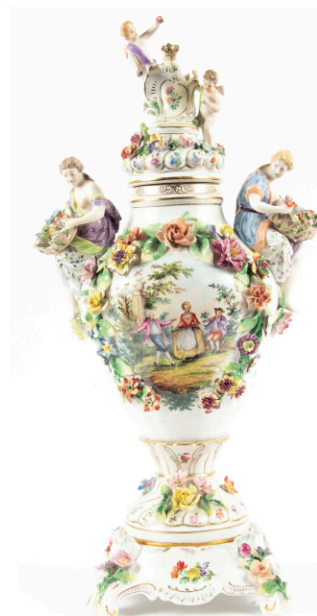
DRESDEN PORCELAIN URN WITH COVER AND BASE H 22"