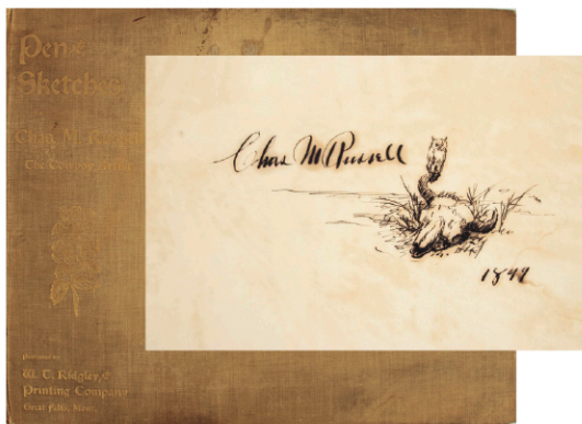
CHARLES MARION RUSSELL (AMERICAN, 1864-1926) PEN SKETCHES BY CHAS. M. RUSSELL THE COWBOY ARTIST, WITH ORIGINAL DRAWING IN INK, H 11.325" W 14"