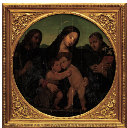
BRESCIA SCHOOL OIL ON GESSO WOOD PANEL, 17TH/18TH C., DIA 36" MADONNA OF THE ROSE