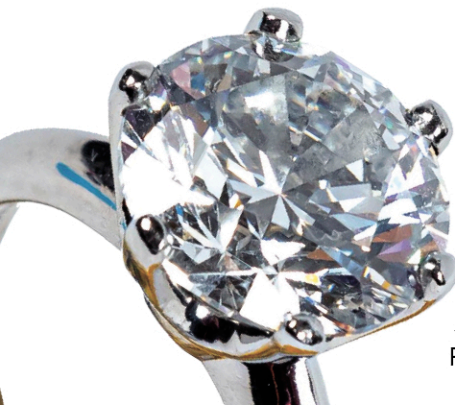
TIFFANY & CO. 4.64 CT. DIAMOND AND PLATINUM RING F COLOR