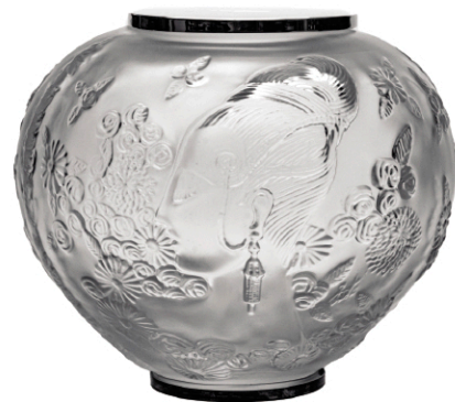
ERTE (RUSSIAN/FRENCH, 1892-1990) GLASS VESSEL, H 10.5", DIA 11", "FLEURS DES FLEURS"