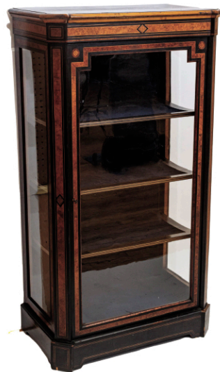
ROBERT STRAHAN & CO. (DUBLIN) EMPIRE CURIO CABINET C. 1820, H 55", W 29.5"