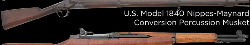
U.S. Model 1840 Nippes-Maynard Conversion Percussion Musket