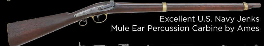
Excellent U.S. Navy Jenks Mule Ear Percussion Carbine by Ames