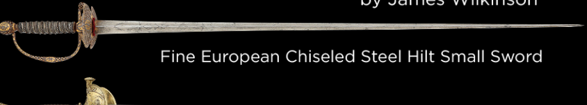
Fine European Chiseled Steel Hilt Small Sword