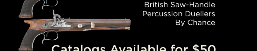
Interesting Pair Of British Saw-Handle Percussion Duellers By Chance