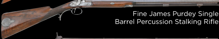
Fine James Purdey Single Barrel Percussion Stalking Rifle