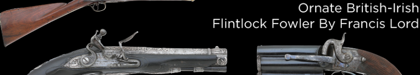
Ornate British-Irish Flintlock Fowler By Francis Lord