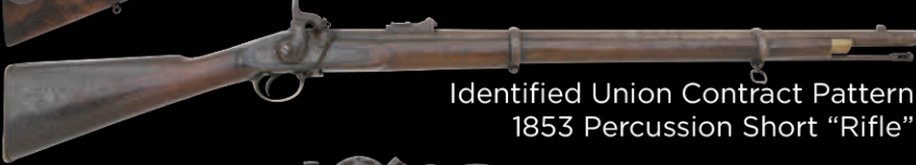
Identified Union Contract Pattern 1853 Percussion Short "Rifle"