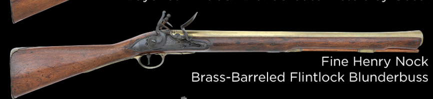
Fine Henry Nock Brass-Barreled Flintlock Blunderbuss