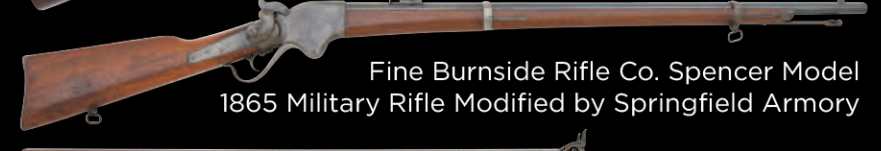
Fine Burnside Rifle Co. Spencer Model 1865 Military Rifle Modified by Springfield Armory