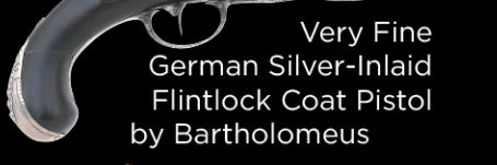
Very Fine German Silver-Inlaid Flintlock Coat Pistol by Bartholomeus