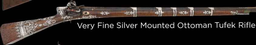
Very Fine Silver Mounted Ottoman Tufek Rifle