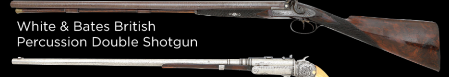
White & Bates British Percussion Double Shotgun