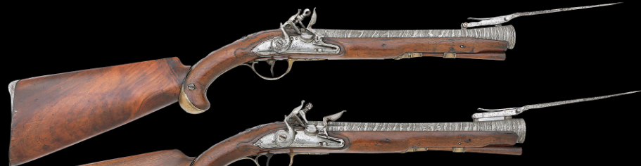
Interesting Pair of Belgian Takedown Snap Bayonet Flintlock Blunderbuss-Pistols by Gosuin