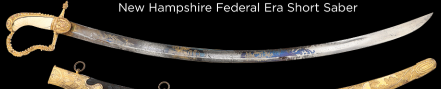
Ornate Mounted Officer's Saber