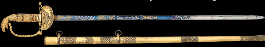
Texas Eaglehead Artillery Officer's Sword