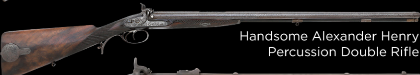
Handsome Alexander Henry Percussion Double Rifle