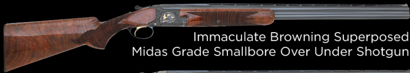
Immaculate Browning Superposed Midas Grade Smallbore Over Under Shotgun