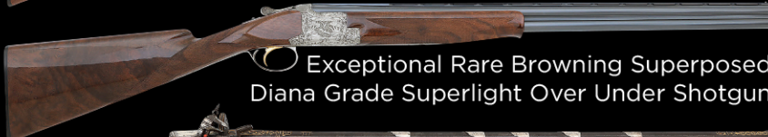
Exceptional Rare Browning Superposed Diana Grade Superlight Over Under Shotgun