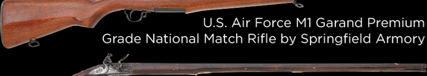
U.S. Air Force M1 Garand Premium Grade National Match Rifle by Springfield Armory