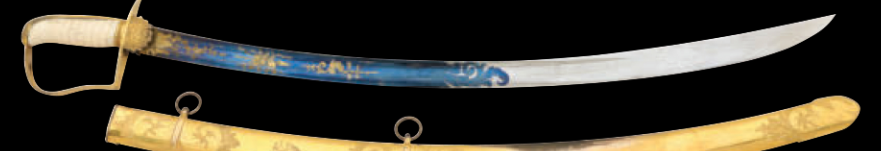
Fine Mounted Artillery Officer's Saber