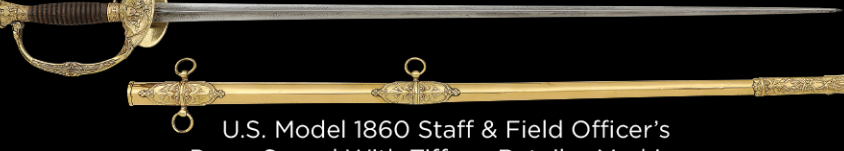
U.S. Model 1860 Staff & Field Officer's Dress Sword With Tiffany Retailer Markings