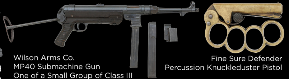
Wilson Arms Co. MP40 Submachine Gun One of a Small Group of Class III Items Offered in This Sale