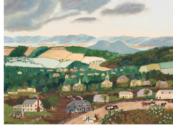
Lot 16. GRANDMA MOSES, Cambridge in May, 1943 , tempera on board, 18 x 24 in., $50,000–80,000