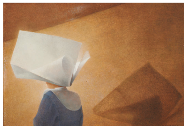
Lot 5. ROBERT VICKREY, Nun , egg tempera on board, 14 x 20 in., $7,000–10,000

VIEW THE CATALOGUE AND BID LIVE AT GROGANCO.COM