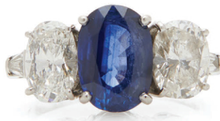
Lot 147. Platinum, Sapphire, and Diamond Ring, $10,000–12,000