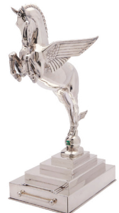
Lot 104. CARTIER Art Deco Silver Figure of Pegasus, $20,000–40,000