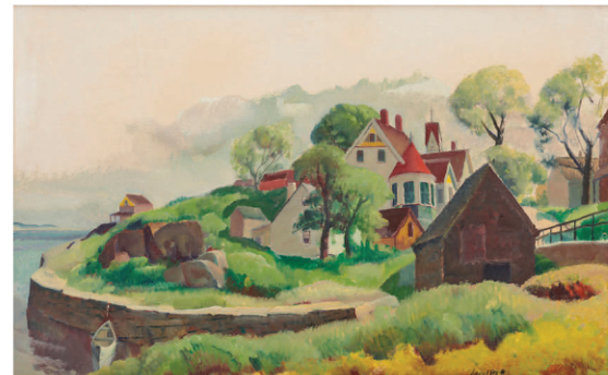
Lot 70. LEON KROLL, Bay View, Gloucester , oil on board, 18 x 28 in., $7,000–10,000