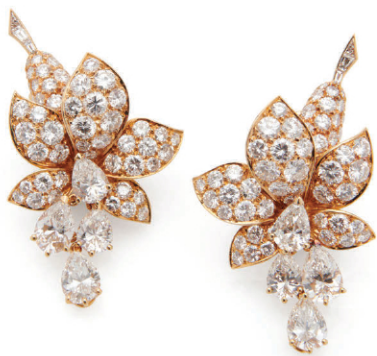
Lot 139. VAN CLEEF & ARPELS Gold and Diamond 'Fuchsia' Earclips, $50,000–70,000