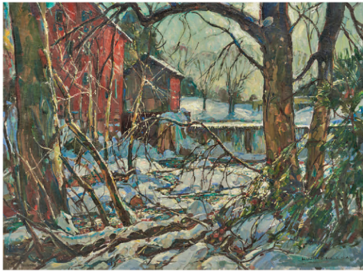
Lot 72. WILLIAM LESTER STEVENS, Snowy River , oil on canvas, 30 x 40 in., $4,000–6,000