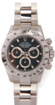
Lot 194. ROLEX Daytona Stainless Steel Chronograph Wristwatch, $15,000–20,000