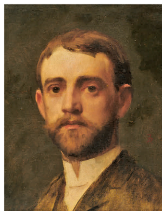
Lot 36. FRANK DUENECK, Theodore Wendel , oil on canvas, 15 x 12 in., $6,000–12,000