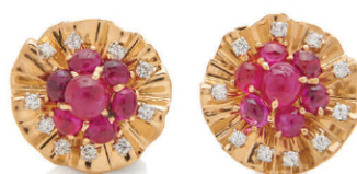
Lot 120. TRABERT & HOFFER MAUBOUSSIN Gold, Ruby, and Diamond Earclips, $2,000–4,000