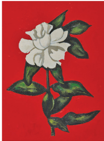
Lot 21. MARSDEN HARTLEY, Wild White Rose , oil on board, 16 x 12 in., $50,000–80,000