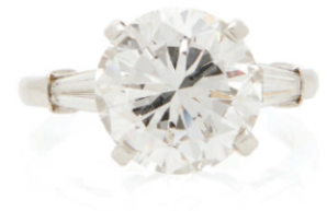
Lot 124. Platinum and 5.19 cts. Diamond Ring, E, VVS2, $60,000–80,000