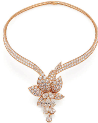
Lot 138. VAN CLEEF & ARPELS Gold and Diamond 'Fuchsia' Pendant/Brooch and Necklace, $60,000–80,000