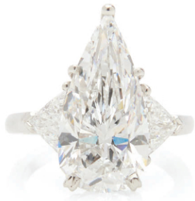
Lot 125. Platinum and 6 cts. Diamond Ring, D, VVS1, $100,000–150,000