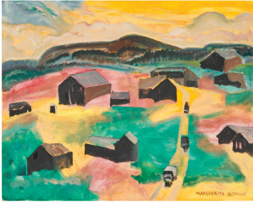
Lot 22. MARGUERITE ZORACH, Mountainside Road , oil on canvas, 16 x 20 in., $6,000–9,000