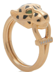
Lot 140. CARTIER Gold and Diamond 'Panthère de Cartier' Ring, $3,000–5,000