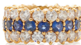
Lot 113. Gold, Sapphire, and Diamond Ring, $4,000–6,000