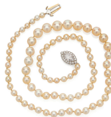
Lot 168. Platinum, Natural Pearl, and Diamond Necklace, $6,000–$8,000