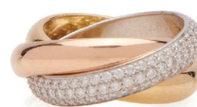
Lot 142. CARTIER Tricolor Gold and Diamond 'Trinity' Ring, $5,000–7,000