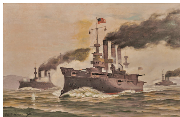
Lot 81. GEORGE SAVARY WASSON, USS Brooklyn at The Battle of Santiago De Cuba , 1901, oil on canvas, 30 x 45 in., $5,000–8,000