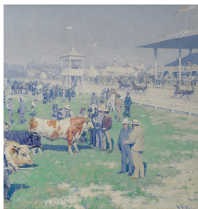
Lot 15. WILLIAM ROBINSON LEIGH, A Horse-Fair Pilgrimage , oil on paper mounted on canvas, 15 7/8 x 15 1/8 in., $10,000–20,000