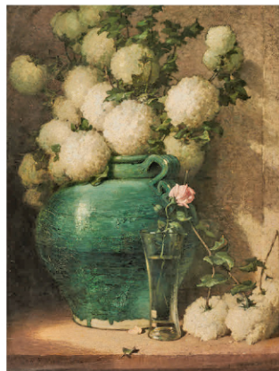
Lot 41. JOHN FERGUSON WEIR, Floral Still Life , 1886, oil on canvas, 32 x 24 in., $7,000–9,000