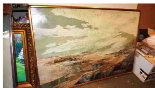
oil/b by L. Sisson, 57 x 40