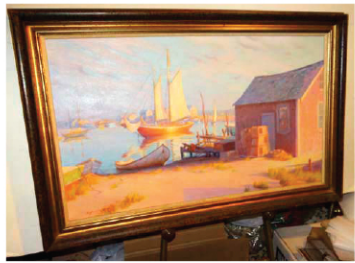
oil/c by Ernest Principato 41 x 24