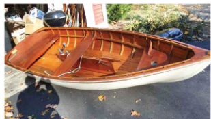
Monroe cat boat, 10'