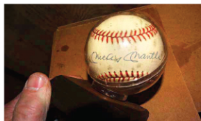
signed "Mickey Mantle" baseball