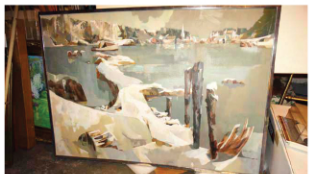
oil/b by Laurence Sisson 59 x 39 1/2