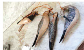
4 Bieber decoys