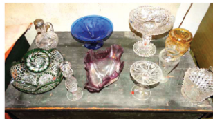
excellent cut glass items