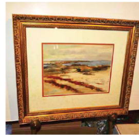
seascape by Colin C. Cooper 16 x 19 1/2