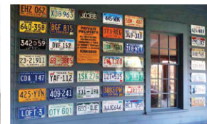
license late collection