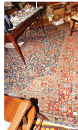
Kashan rug 11'8" x 8'5"