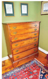
3-drawer blanket chest