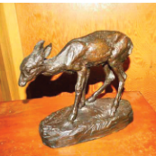
bronze deer by A. Phimsister Proctor, 91

FURNITURE: period corner cupboard; early 3-drawer blanket chest; period wing-back chair; early folding game table; period lowboy; English 3-drawer stand; tavern table; Mission-Oak bookcase; blanket box; sea chest; 2-drawer sewing stand; 2-drawer and one-drawer blanket chests; 1/2 round period table; 19th cent. adjustable stool; dough box; marble top table; slant top desk; German Grandfather clock; 4 period Windsor chairs; Stickley Brandt bench; period corner chair; period mirror; Oriental rugs (8'x 63", 143" x 93", 5' x 3'6", 5' x 7', 11'8" x 8'5", two 12' x 8') 2 runners (16' x 31", 14' x 3'); MISC bronze bust "Big Beaver"; bronze deer "Phimsister Proctor, 91"; bronze bear by A. Humphrey, 1912; metal sculpture bust by Konzal; 1948 Old Towne, 7'x4" "A Rowing Canoe" in excellent condition; 10' Monroe Cat Boat in excellent condition; YEI Navaho rug; 2 Acoma N.M. pots by Sarah Garcia; wooden Ghee pot;