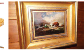
oil/c "Shipwreck" by G. W. Whitaker, 4 1/4 x 6