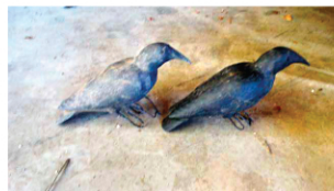
2 vintage crow decoys