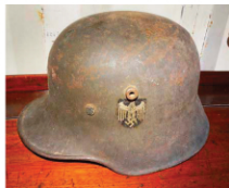
German WWII helmet