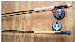
2 Orvis reels and Orvis/Brightwater rods