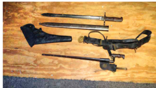
saw tooth bayonet and accessories