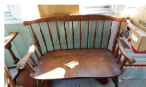
Stickley Brandt bench