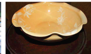
Rookwood bowl "Katara" #42713