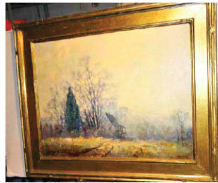
oil/c by Henry Eddy, landscape 41 x 30