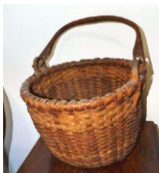
swing handle basket by Rouse Matterson