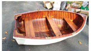
1948 Old Towne "A Rowing Canoe" 7'4"