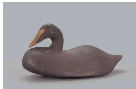
Eider Hen from Penobscot Bay, ME, c. 1920