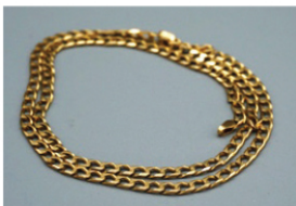
A Great Selection of Estate Jewelry

PREVIEWS: FRI. MARCH 4, 4-6 PM • SAT. MARCH 5, 9-9:45 AM