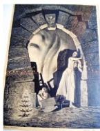
Signed Rockwell Kent