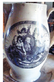
Early John Adams Presidency Liverpool Jug