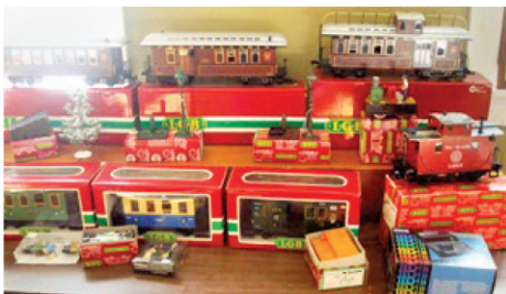
A Complete Setup of Lehmann Trains, Etc. (One Lot)