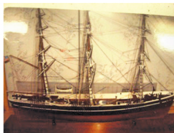
"The Sovereign Of The Seas" Cased Ship Model