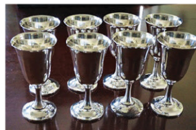
A Large Selection of Estate Sterling