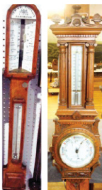
A Good Selection of 19th C. Barometers