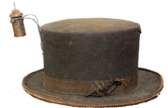
Rare Campaign Torch With Hat