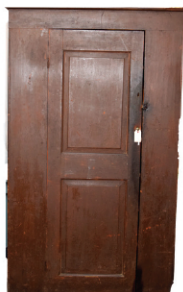
Early Untouched Cupboard In Original Reddish Brown Paint