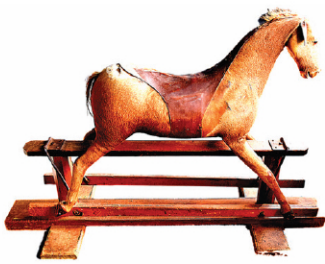
Early Rocking Horse