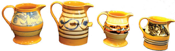
Nice Selection of Mochaware Pitchers