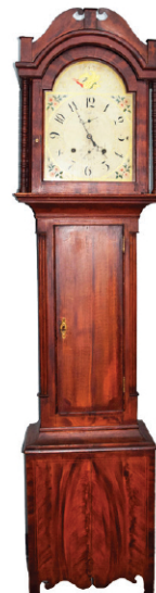
Early Grain-Painted Tall Clock With Rare 8 Day Movement