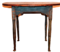
Queen Anne Button-foot Table in Original Paint