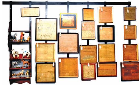
Extensive Collection of Samplers