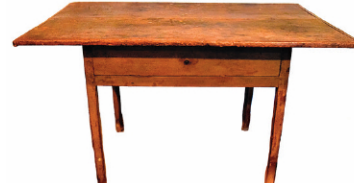
Early Tavern Table - Untouched Condition