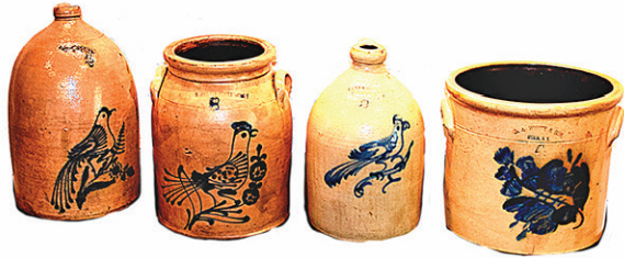
Collection of Blue Decorated Crocks and Jugs

Due to Covid-19 considerations, the auction will be posted on LiveAuctioneers and Invaluable as well as phone and absentee bidding