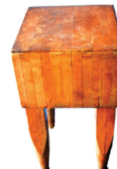
Kitchen Butcher Block