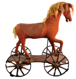
Wheeled Horse Toy

Presented by NEW HAMPSHIRE AUCTIONS AND APPRAISALS, LLC