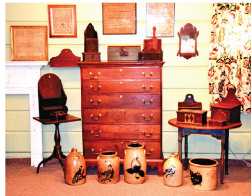
Some Selected Items From The Sale