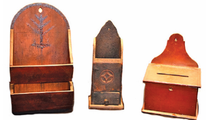
Early Wall and Ballot Boxes