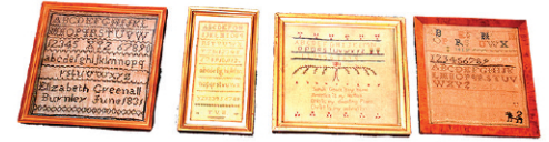
Large Collection of Samplers