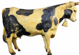
Papier Mache Cow