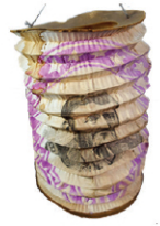
U.S. Grant Paper Lantern