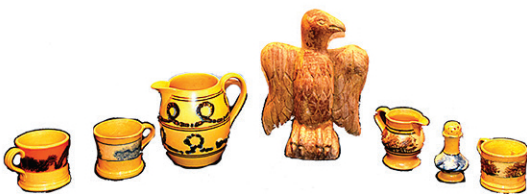
Nice Selection of Mochaware