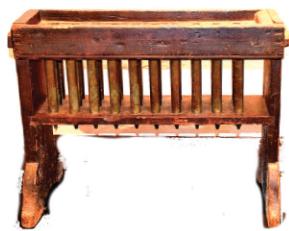
18th C. Candle Mold Rack