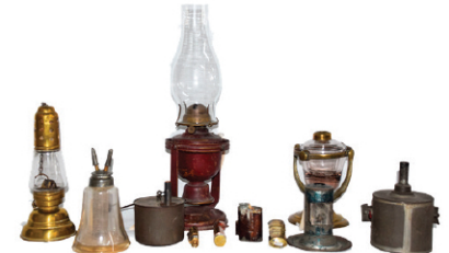
Collection of Lighting and Fire Devices