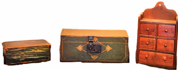
Large Selection of Early Document and Wall Boxes