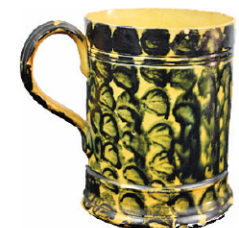
Rare Mochaware Mug