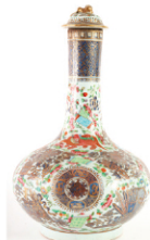
(19th c) CHINESE EXPORT PORCELAIN BOTTLE VASE