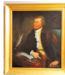
AMERICAN SCHOOL (18th c) "PORTRAIT OF A MERCHANT"