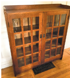
STICKLEY ARTS AND CRAFTS OAK BOOKCASE