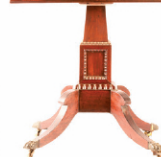
DUNCAN PHYFE MAHOGANY WORK TABLE