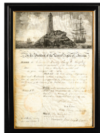
1796 SHIP'S PASSPORT signed by GEORGE WASHINGTON