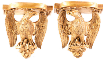
RARE PAIR OF EARLY AMERICAN EAGLE BRACKETS