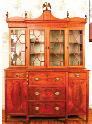
FEDERAL PERIOD MAHOGANY BREAKFRONT