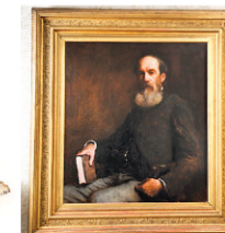
FRANK HOLL (1845-1888)

We invite you to join us for this spectacular on-site Estate Sale with something for everyone.