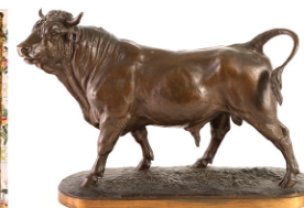
ISIDORE JULES BONHEUR (1827-1901)