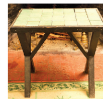
POTTING STAND topped with (24) GRUEBYTILES