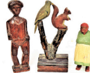
Several Lots of Early Folk-Art Carvings