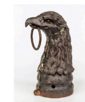
Early Hitching Post