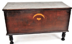
Early Paint Decorated Blanket Chest