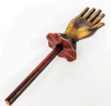
Lodge Folk-Art Hand Carving