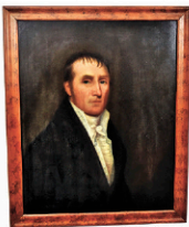
Portrait Painting by T. Young 1810