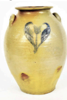
Over 20 Pieces of Blue Decorated Stoneware