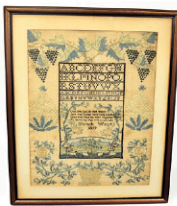
Wonderful Baltimore Needlework Sampler