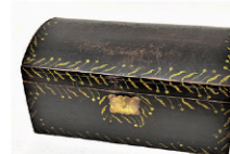
Several Early Paint Decorated Boxes