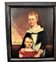
Early Folk-Art Painting of Children

ANTIQUE FURNITURE: Several pieces of antique furniture including early blanket chest with paint decorated heart and half-moon; early cherry sugar chest; cherry cellarette; cherry lift-top stand; grandfather clock; walnut flat wall cupboard with high cut out base; curly maple nightstand; pie safe with heart tins; unusual paint decorated blanket chest; unusual candle stands; etc.