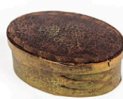
Several Shaker Items