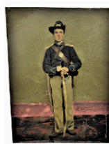
Civil War Items