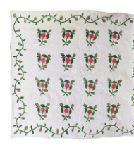
Over 25 Quilts and Coverlets