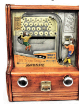
Coin Operated Football Game