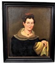
Early Portrait Painting