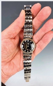
Le Coultre 14k White Gold Watch & Band with Diamonds