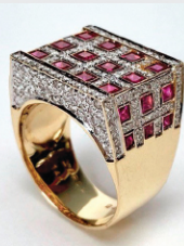
14k Yellow Gold Ring Mounted with 232 Diamonds