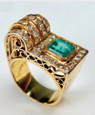
14k White Gold Ring (Yellow Gold Plated) with Emerald