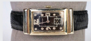
Hamilton 14k Gold Tank Watch, Diamond Face