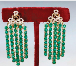
Pair 14k Emerald & Diamond Dangle Earrings

Once again, we are offering a nice collection of vintage, antique and newer jewelry from several local estates with no reserves. Included in this Spectacular Holiday auction is a selection of vintage wrist watches, pocket watches, gold, platinum rings, necklaces, bracelets with emeralds, opals, sapphires, diamonds, amethysts, etc., with names such as Cartier and Tiffany and so much more!!!