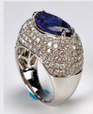
14k Gold Tanzanite & Diamond Pave Ring