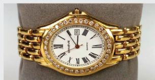
Geneve 18k Gold Quartz Women's Watch