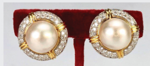
18k Y.G. & W.G. Earrings with Cultured Mabe Pearls