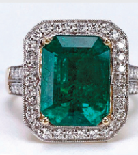
18k Ladies Emerald & Diamond Ring