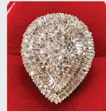
14k White & Yellow Gold Ring with Baguette Diamonds