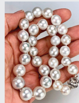
12mm-15mm South Sea Cultured Pearl Necklace