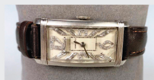
Longines Platinum Watch with Diamond Face