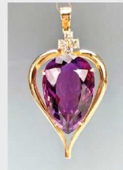
14k Yellow Gold Pendant with Pear Shape Amethyst