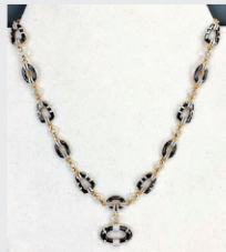
18k Oscar Friedman Diamond Necklace