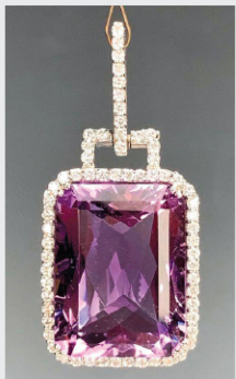
14k White Gold Pendant with Emerald Cut Amethyst