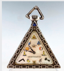
Masonic Sterling Pyramid Pocket Watch, M.O.P. Face